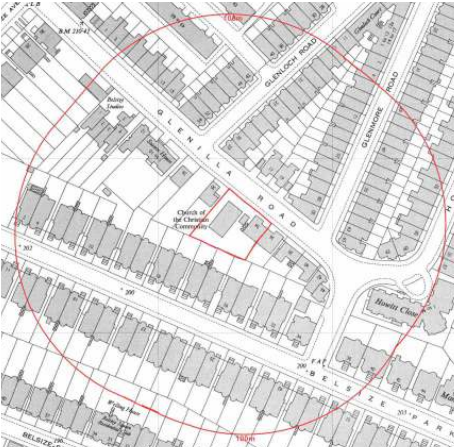
Historical map 1953