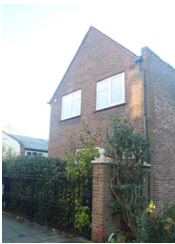
30 Glenilla Road