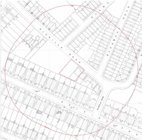
Historical map 1919