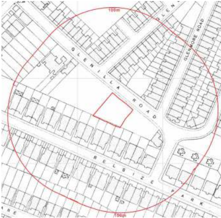
Historical map 1915