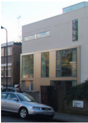
28 Glenilla Road