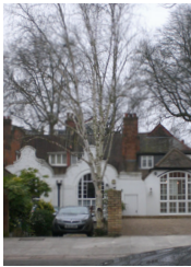
1-5 Glenilla Road