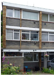
28b Glenilla Road