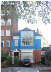
12 Glenilla Road