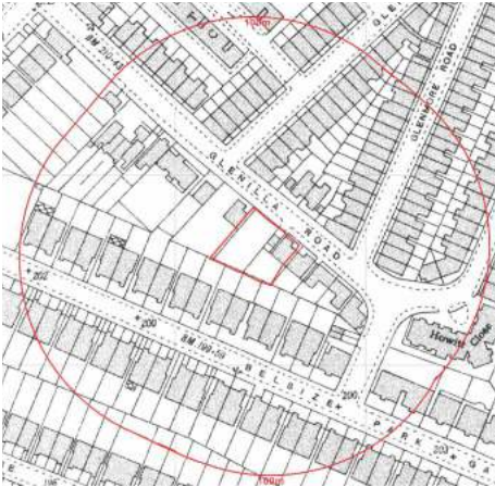
Historical map 1939