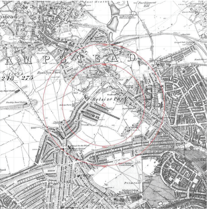
Historical map 1872-1874, map name 'Country Series'