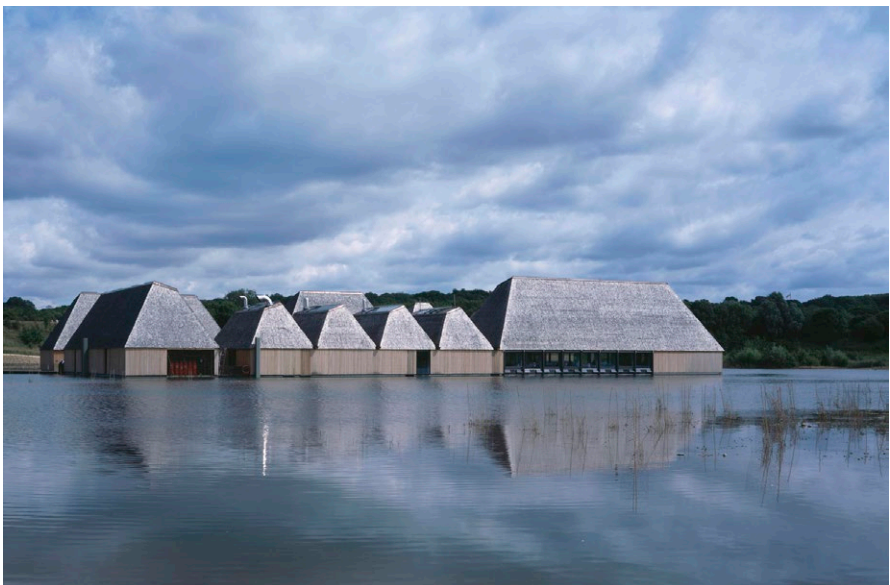
Brockholes Nature Reserve