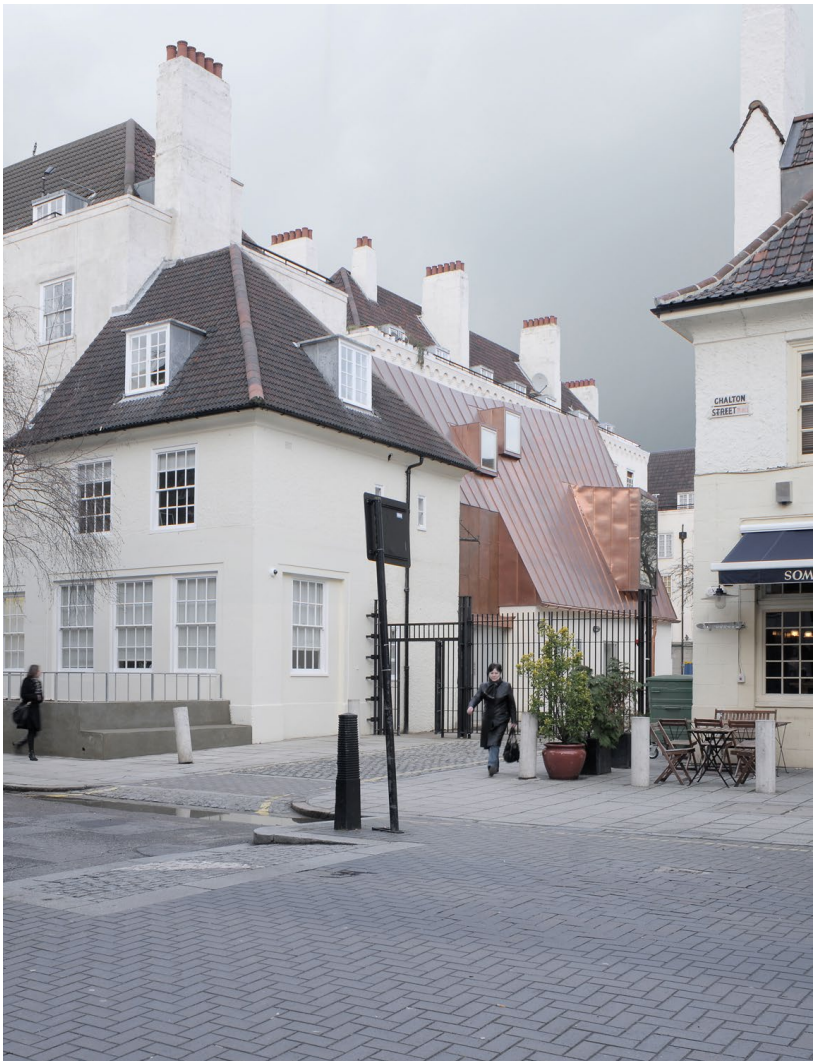
New Horizon Youth Centre