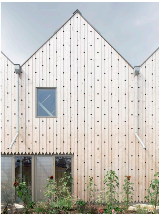
Playbarn at Pensthorpe