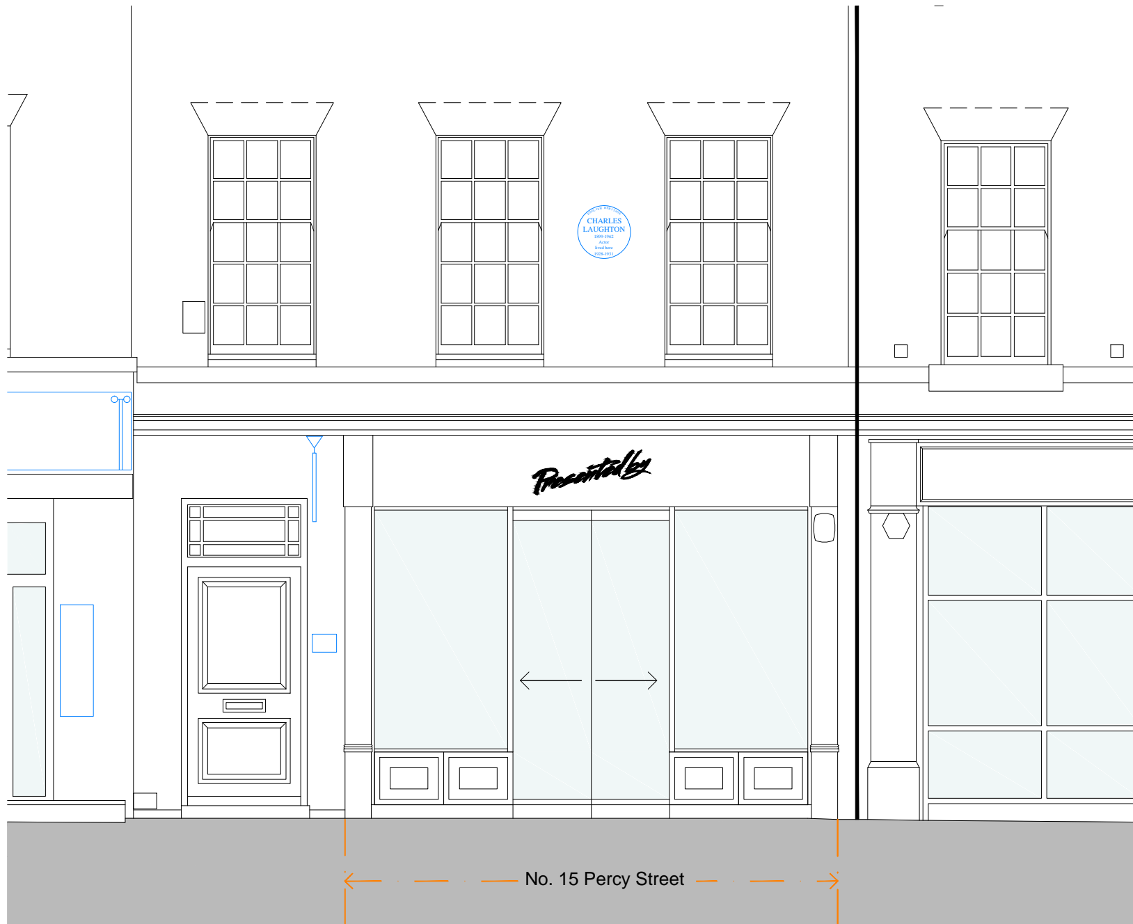
SHOPFRONT SIGNAGE @ 1:50