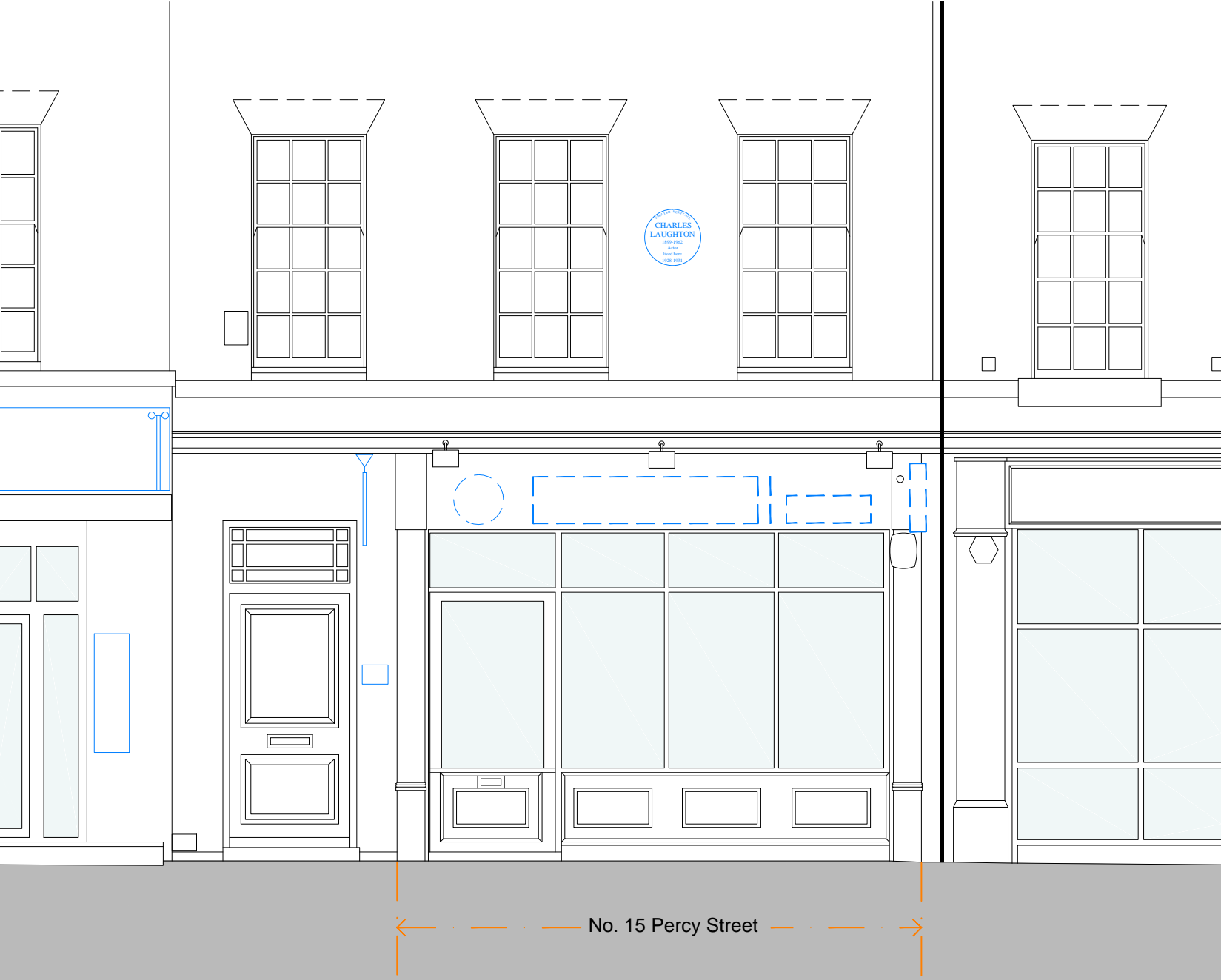
PERCY STREET ELEVATION @ 1:50