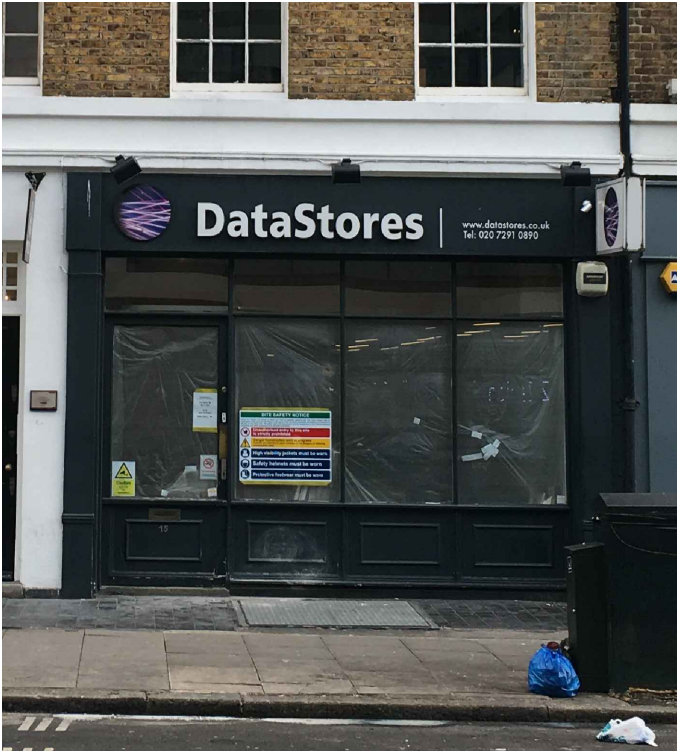
Photograph of Existing Shopfront Signage

The use of this data by the recipient acts as an agreement of the following statements. Do not use this data if you do not agree with any of the following statements:- All drawings are based upon site information supplied by third parties and as such their accuracy cannot be guaranteed. All features are approximate and subject to clarification by a detailed topographical survey, statutory service enquiries and confirmation of the legal boundaries. Do not scale except for the purposes of planning. Report any discrepancies in writing to Palmer Lunn Architects before proceeding.