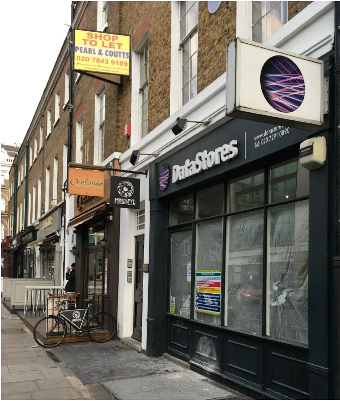
Photograph of Existing Shopfront Signage