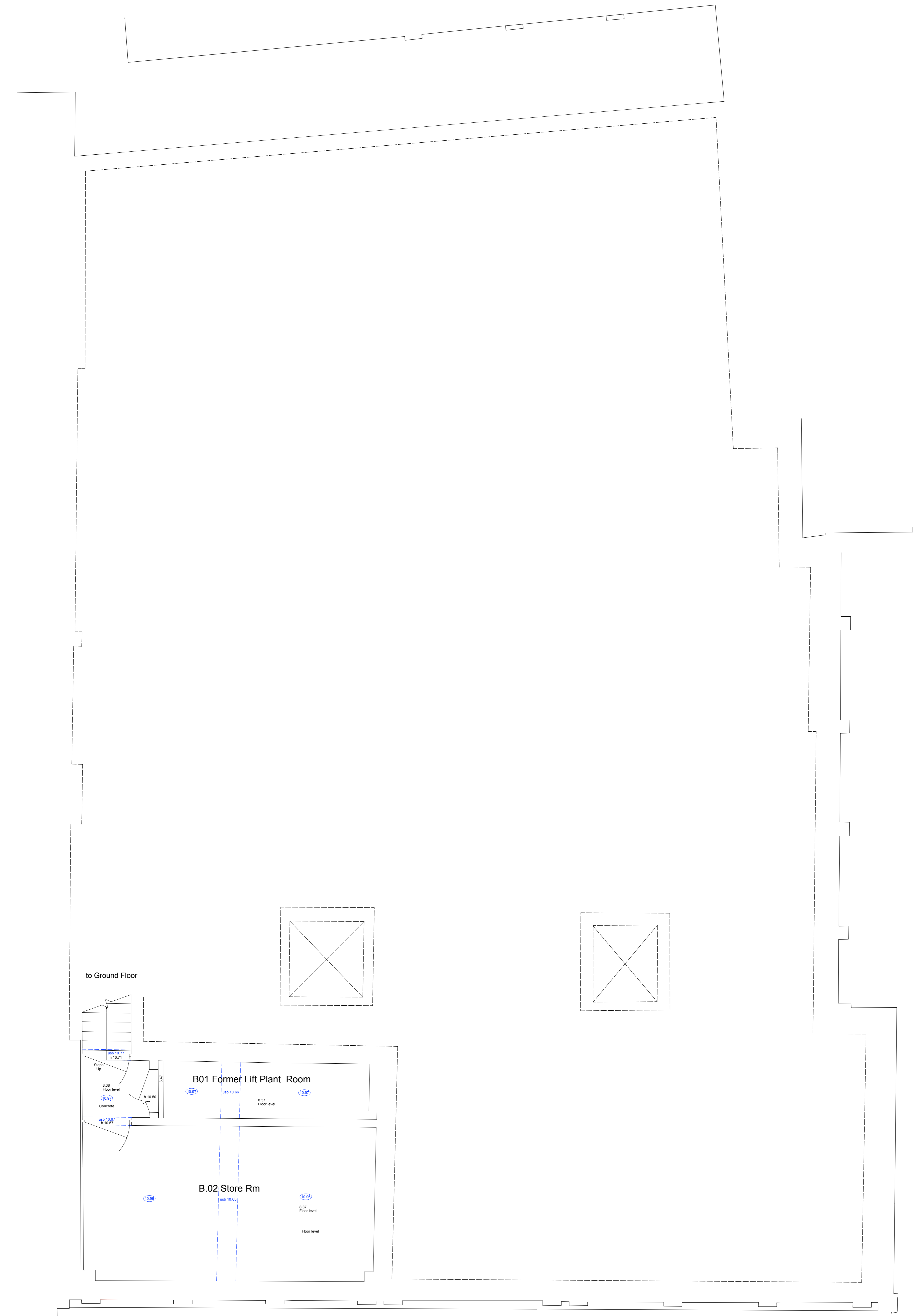
Existing Basement Floor Plan