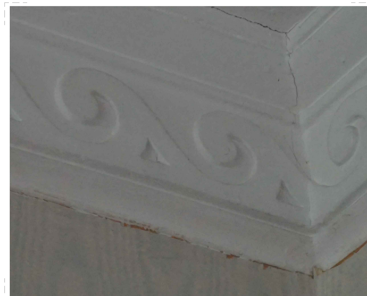
08 Cornice Type 5