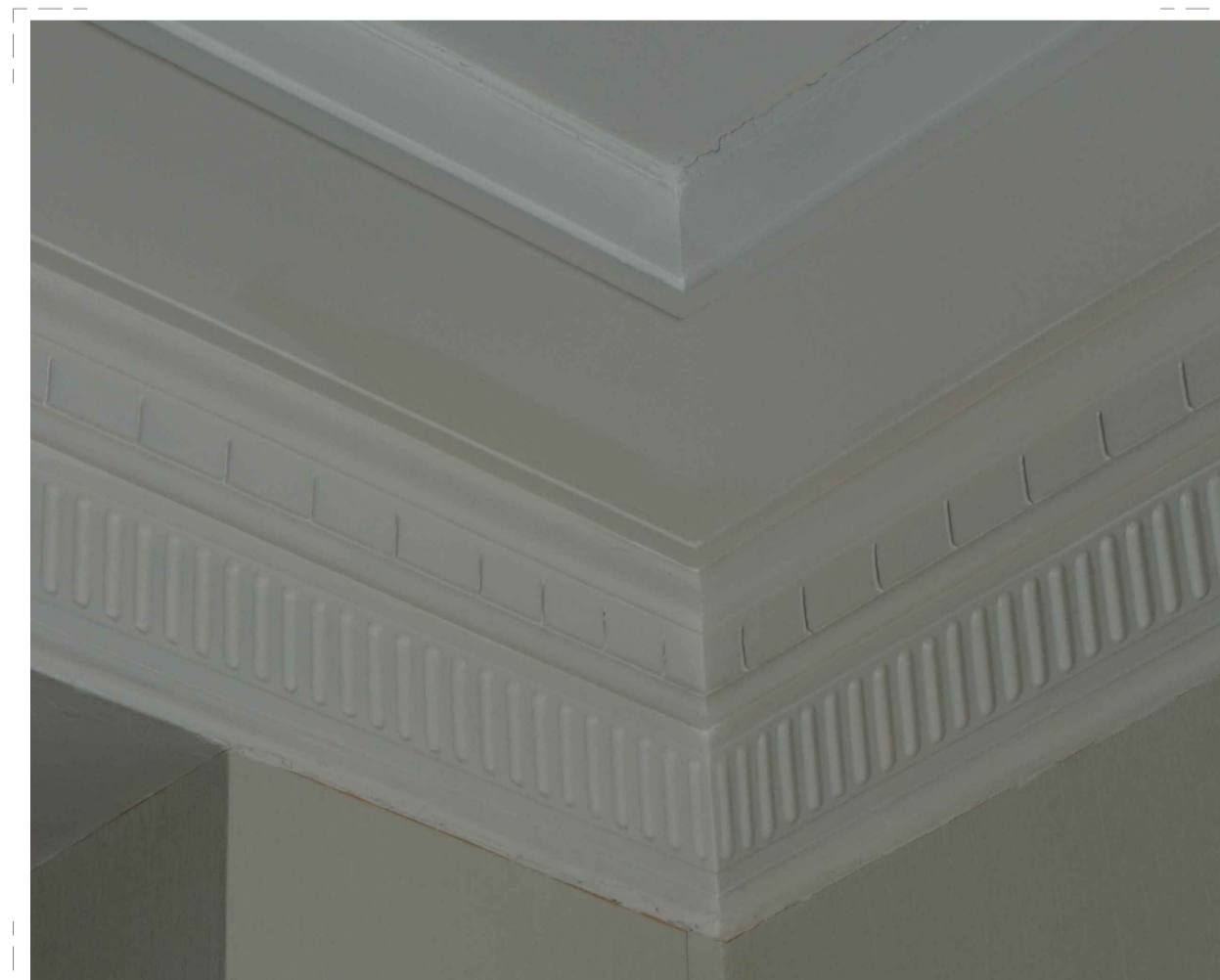
06 Cornice Type 3