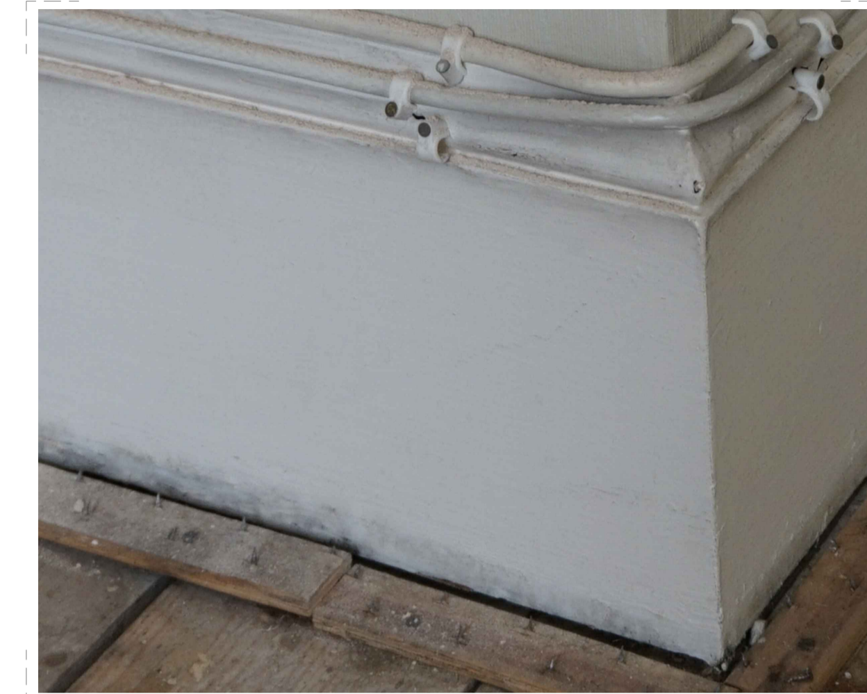
03 Skirting Type 4