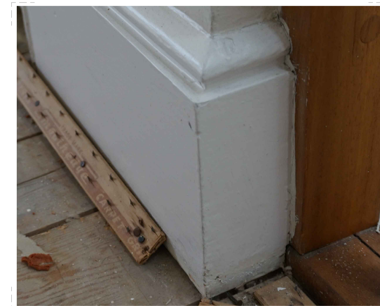
04 Skirting Type 5