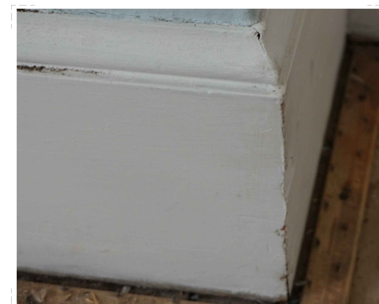
05 Skirting Type 6

Notes: Drawings are based on survey data and may not accurately represent what is physically present. Do not scale from this drawing. All dimensions are to be verified on site before proceeding with the work. All dimensions are in millimeters unless noted otherwise. Purcell shall be notified in writing of any discrepancies.