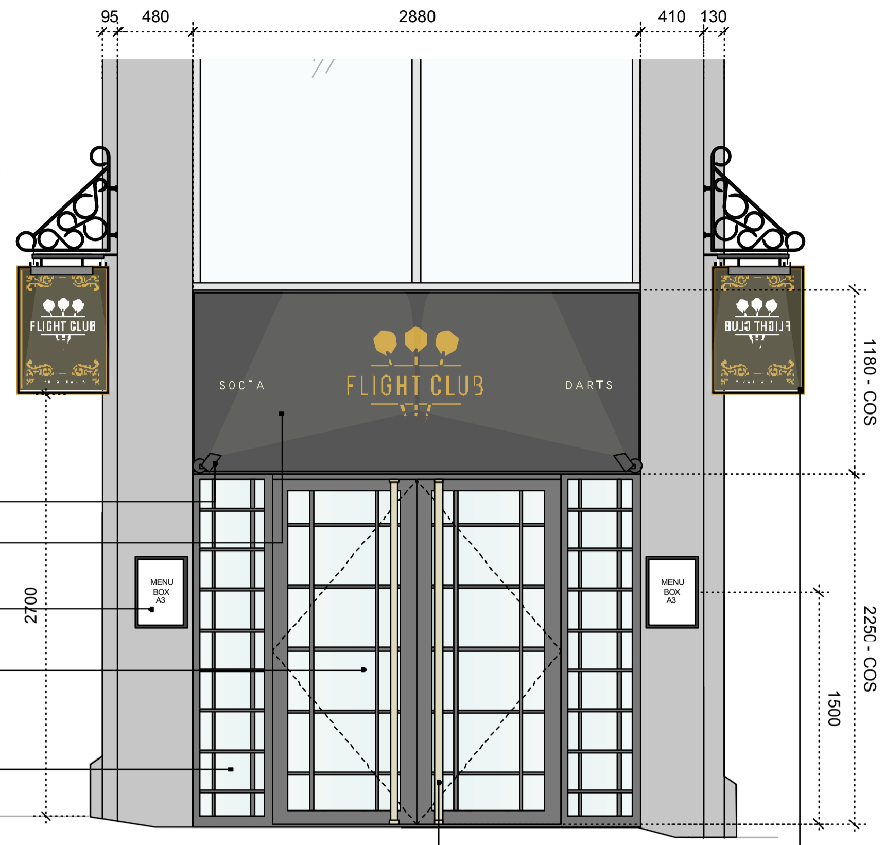
2 PROPOSED NORTH WEST ELEVATION PLN-02 Scale: 1:25 @ A1; 1:50 @ A3