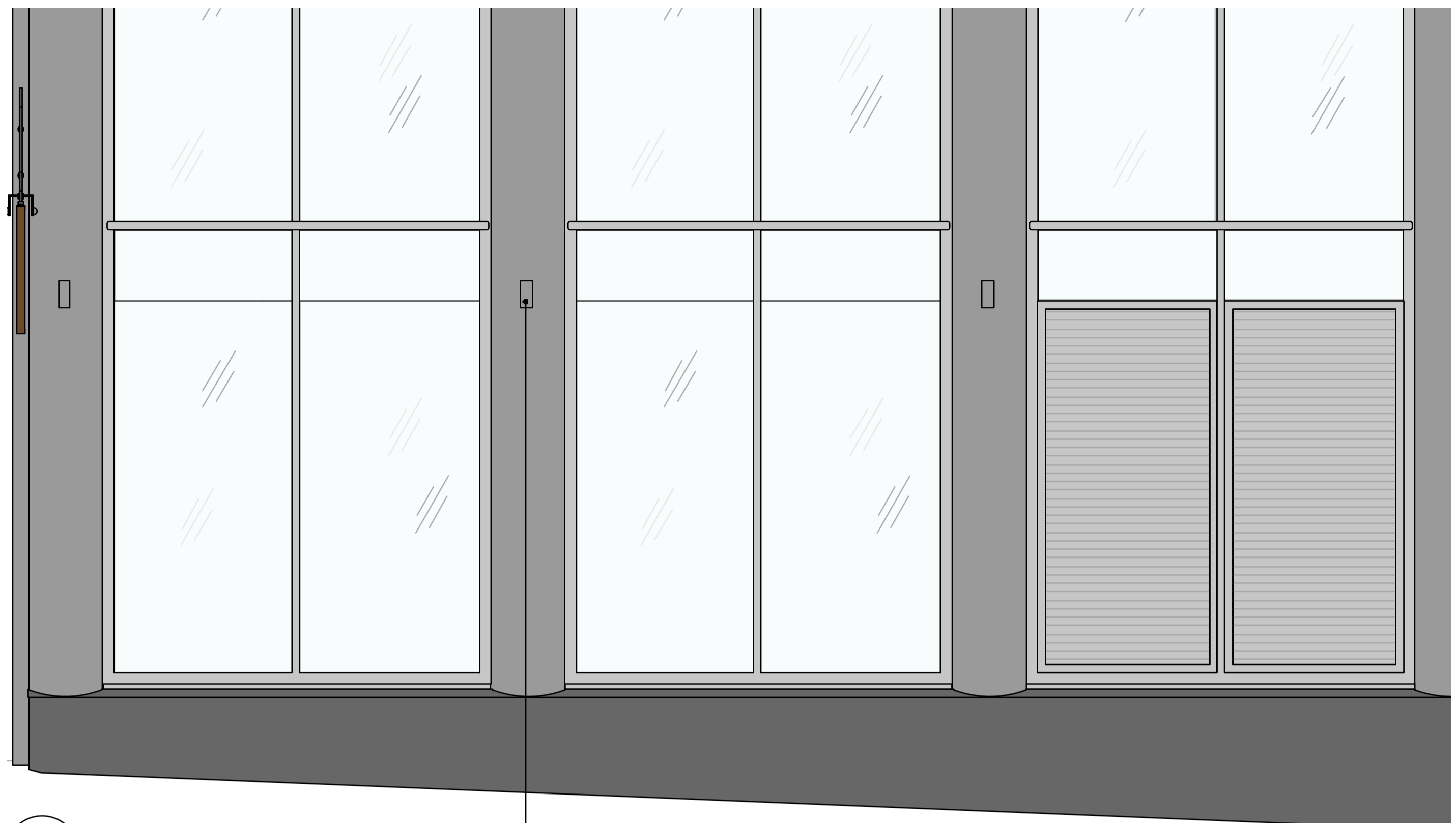
3 PROPOSED SOUTH WEST ELEVATION PLN-02 Scale: 1:25 @ A1; 1:50 @ A3