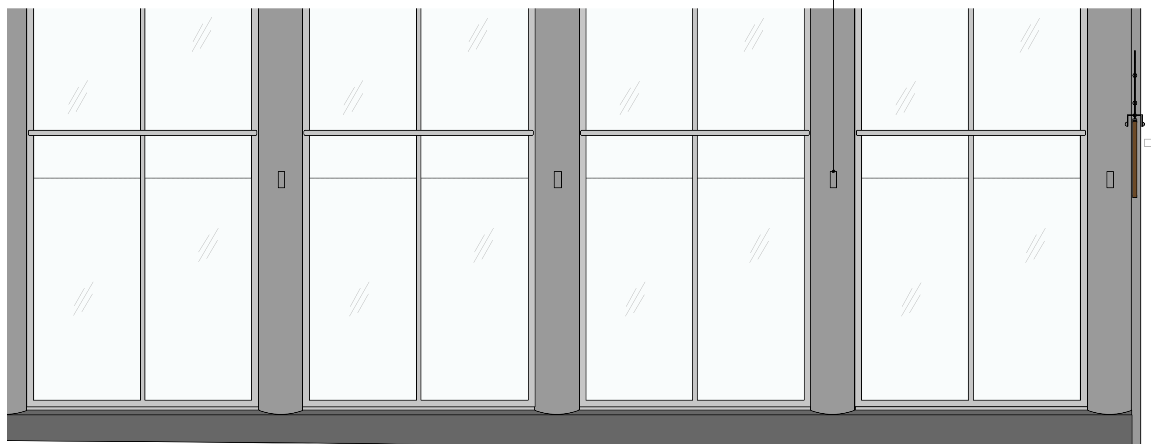
4 PROPOSED NORTH ELEVATION PLN-02 Scale: 1:25 @ A1; 1:50 @ A3

NEW PUB SIGN WITHIN A THIN WOODEN FRAME WITH GUILDED GLASS IN CENTRE ILLUMINATED WITH INTEGRATED LIGHTING - SEE DRAWING PLN-03