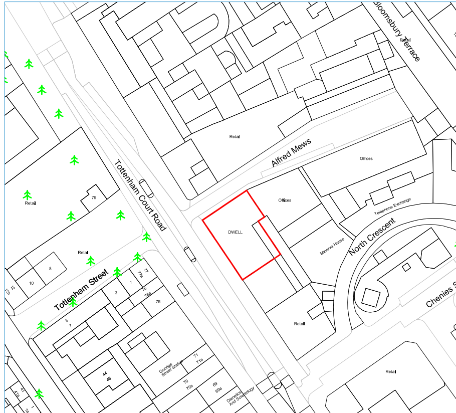
Location plan Site boundary marked by solid red line

Note: Scale will measure 8cm when printed to correct scale