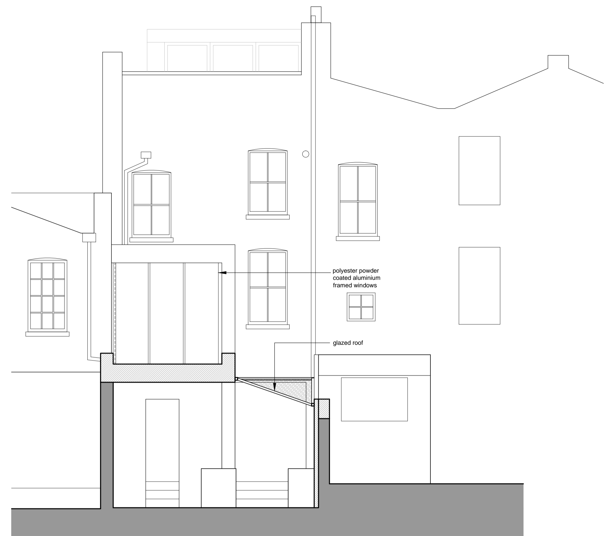
PROPOSED SECTION EE