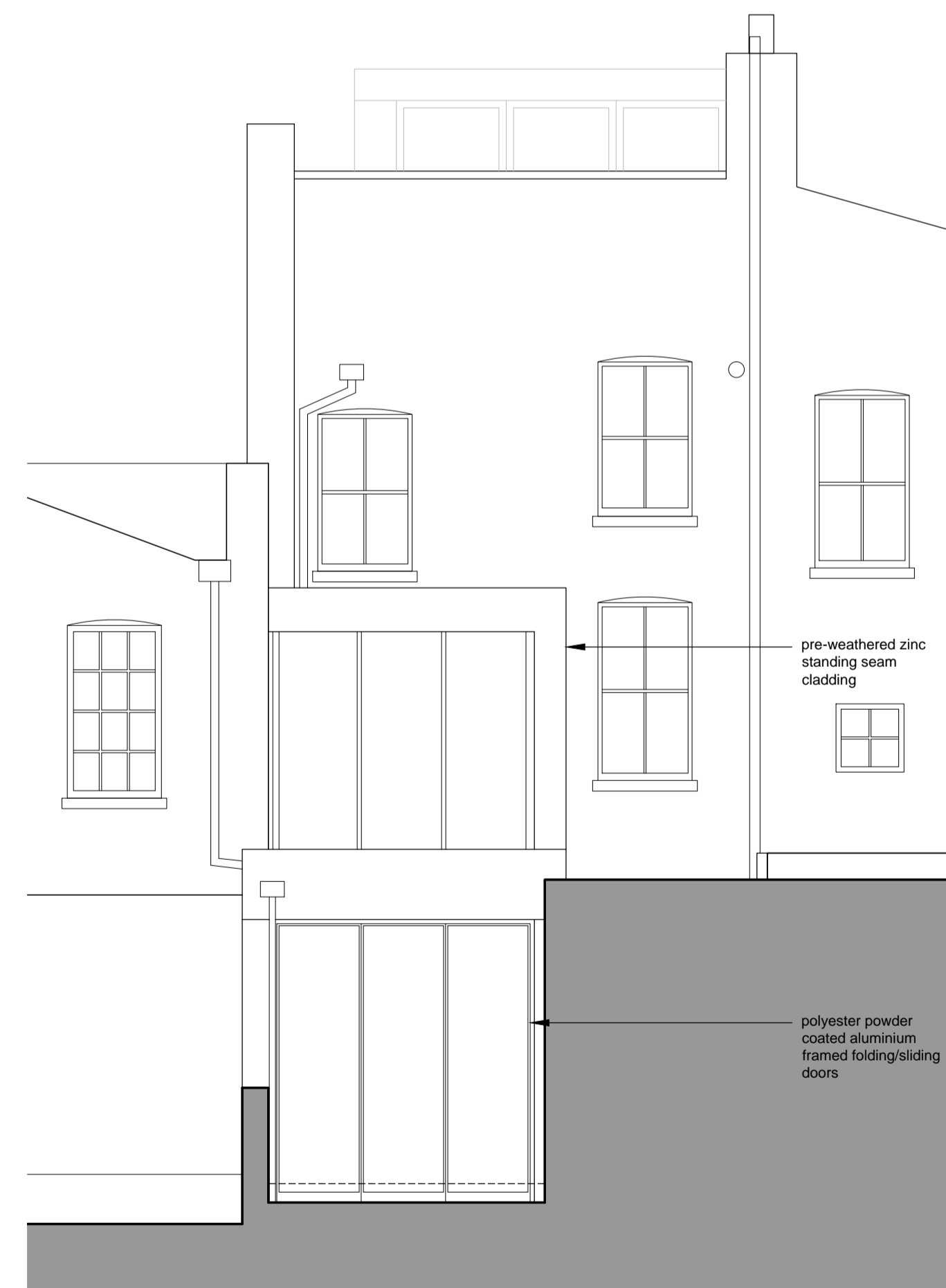
PROPOSED SECTION FF / REAR ELEV.