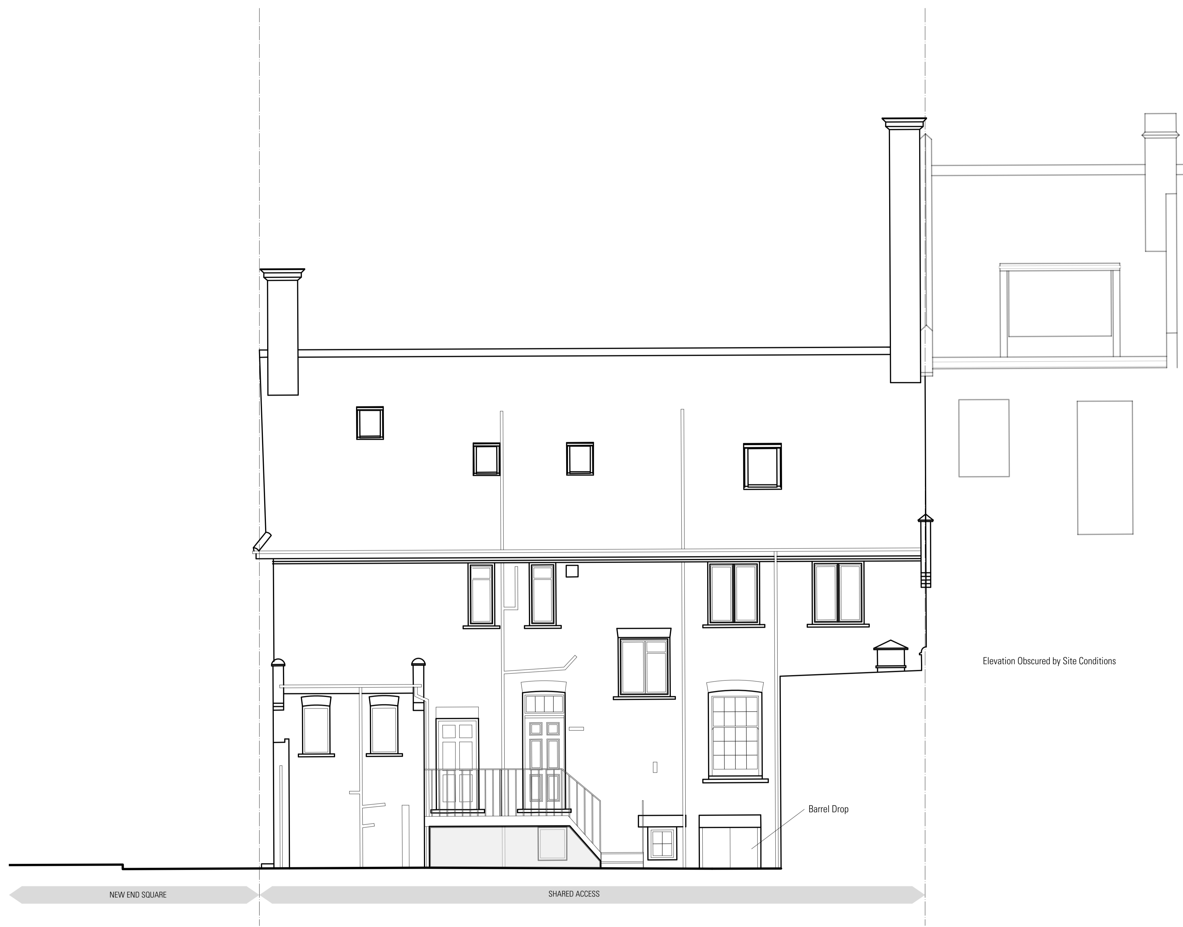
01 Proposed Southeast Elevation Scale 1:50@A1, 1:100@A3