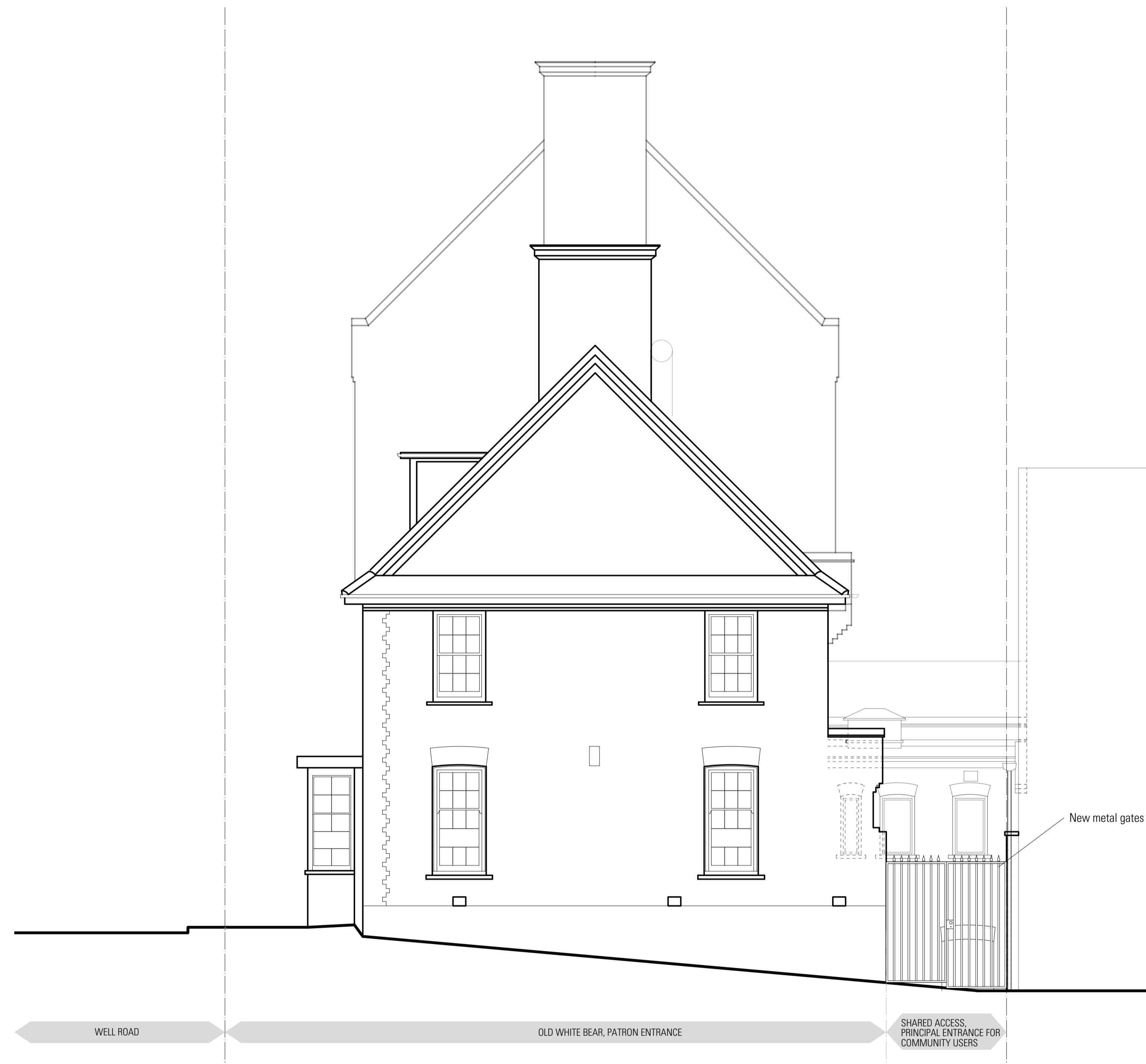
01 Proposed Southwest Elevation Scale 1:50@A1, 1:100@A3