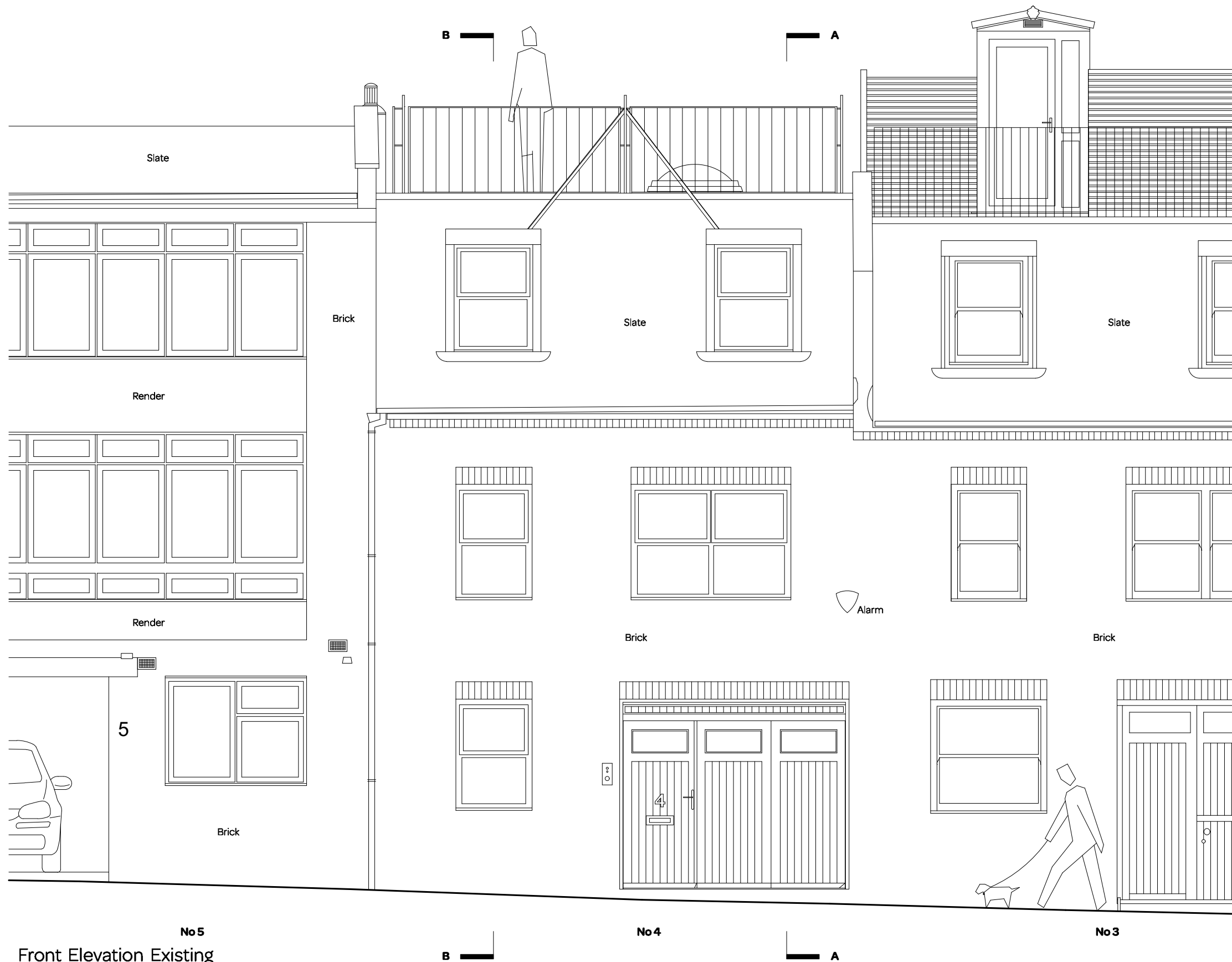
No 5 Front Elevation Existing