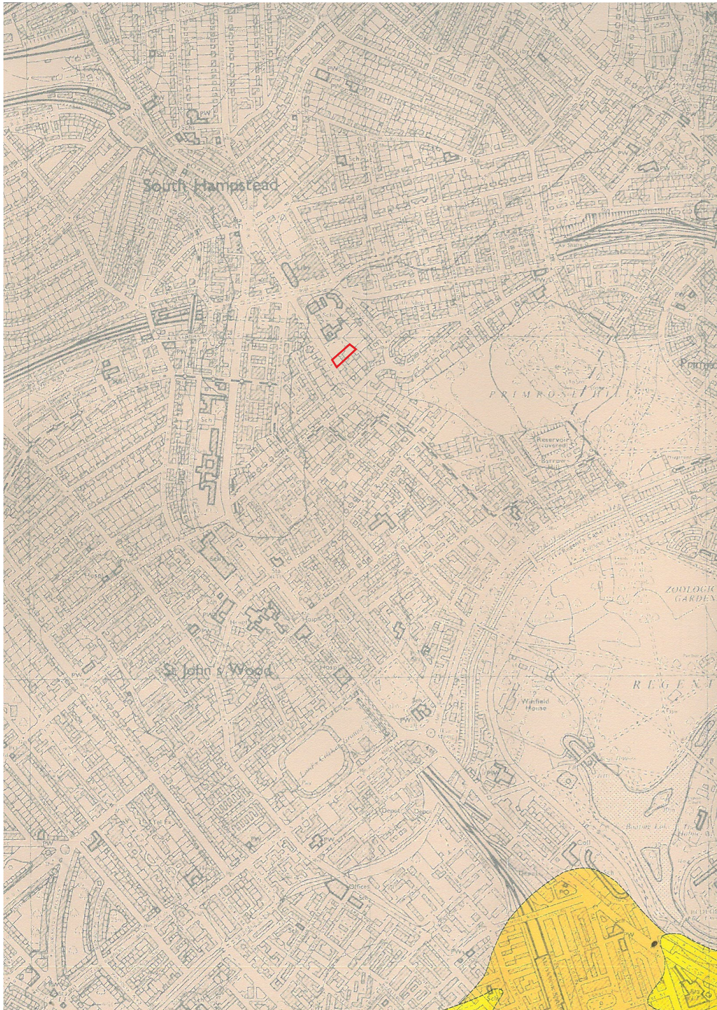
1999 Geology map