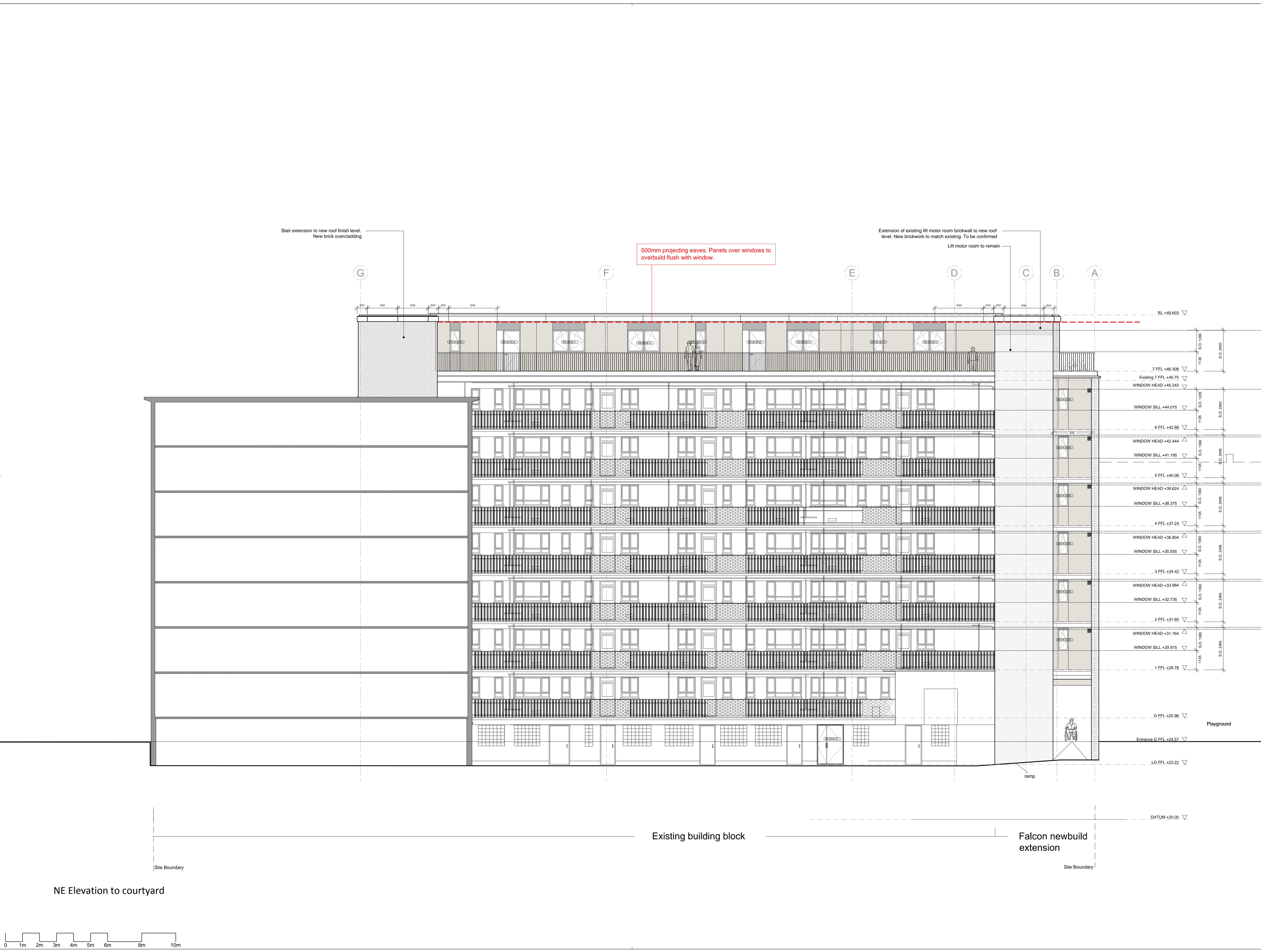
NE Elevation to courtyard

© Avanti Architects Ltd www.avantiarchitects.co.uk 361-373 City Road + 44 (0) 20 7278 3060 London EC1V 1AS aa@avantiarchitects.co.uk