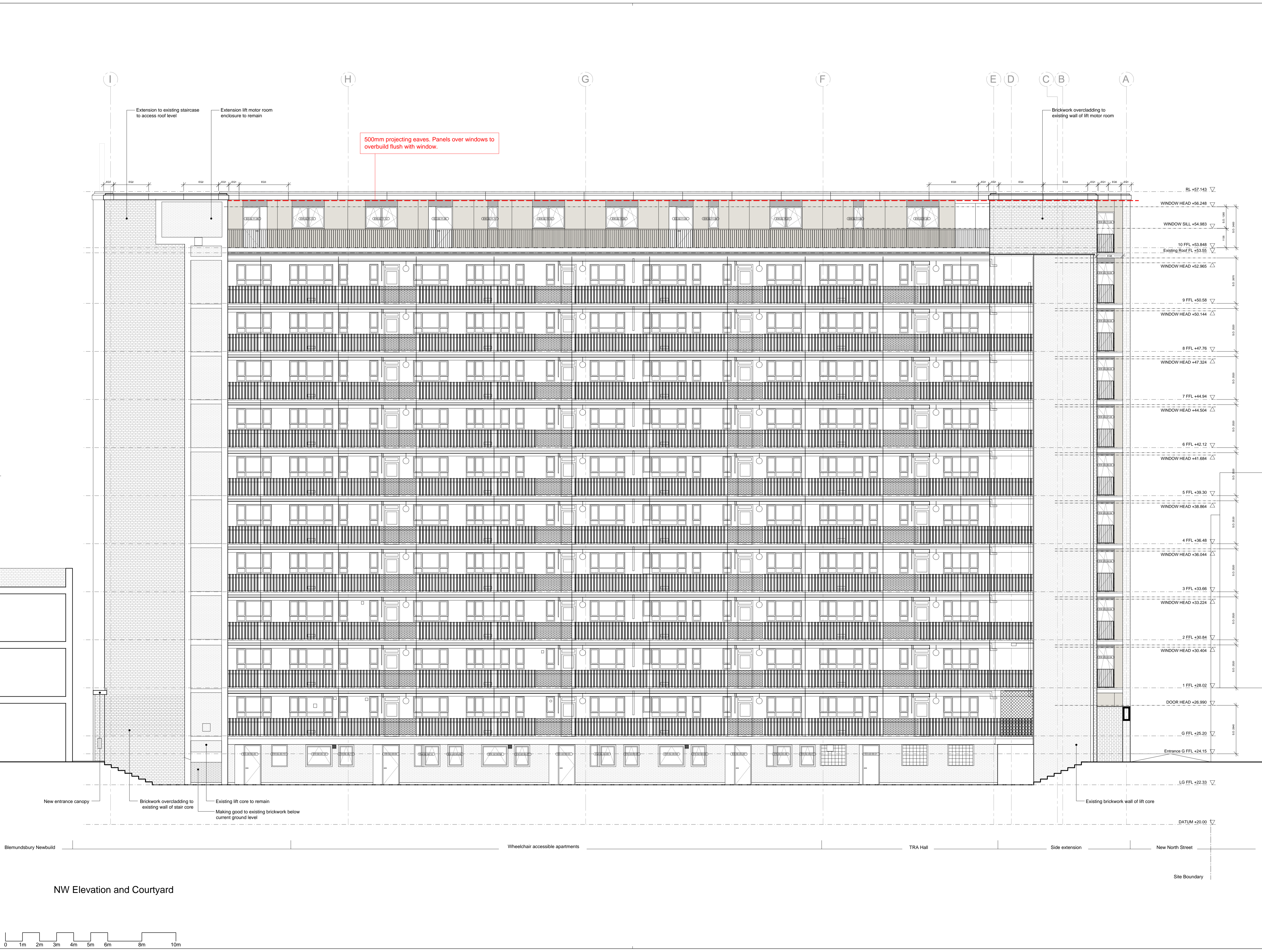
NW Elevation and Courtyard

© Avanti Architects Ltd www.avantiarchitects.co.uk 361-373 City Road + 44 (0) 20 7278 3060 London EC1V 1AS aa@avantiarchitects.co.uk