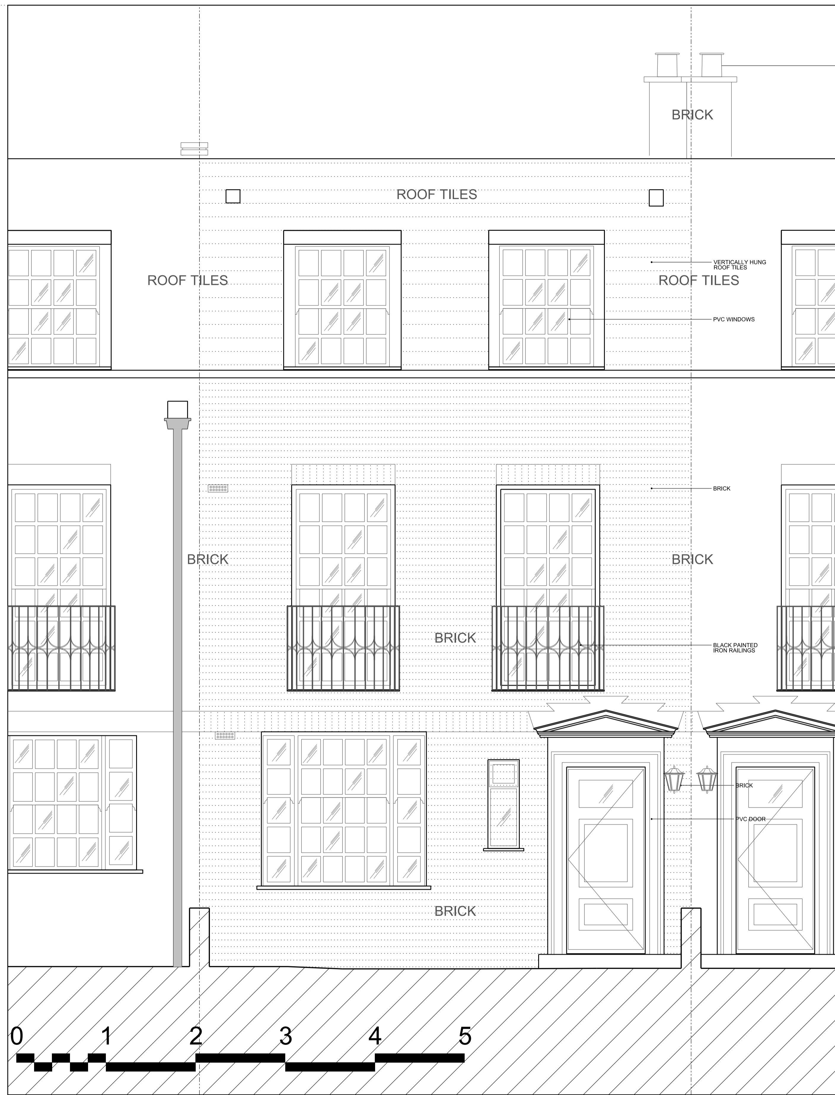
1 ELEVATION Front 1:25