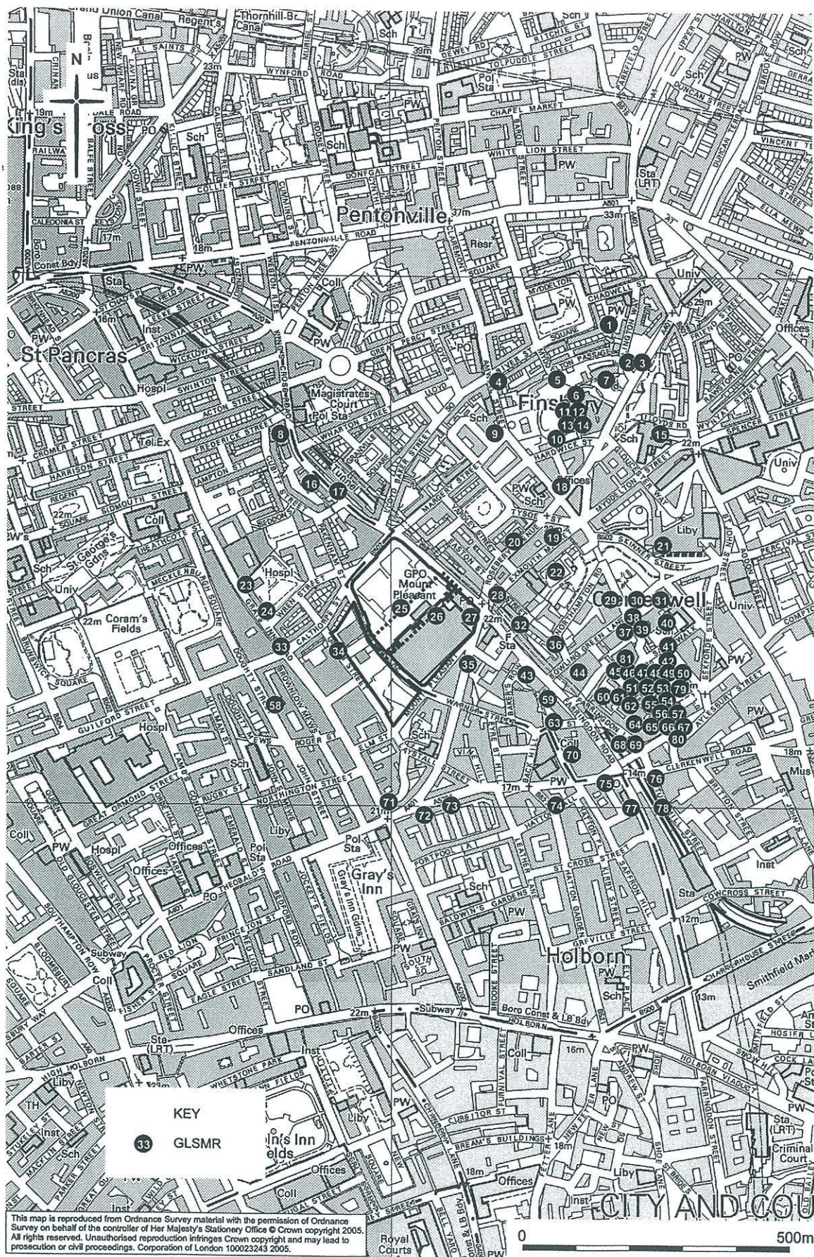
Fig 23 Greater London Sites and Monument Record entries within a 500m radius of the site