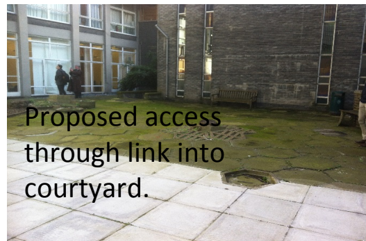
Existing wall and roof removed to create access to courtyard for new extension. Existing concrete floor slab back propped and temporary waterproofed with temporary access road.