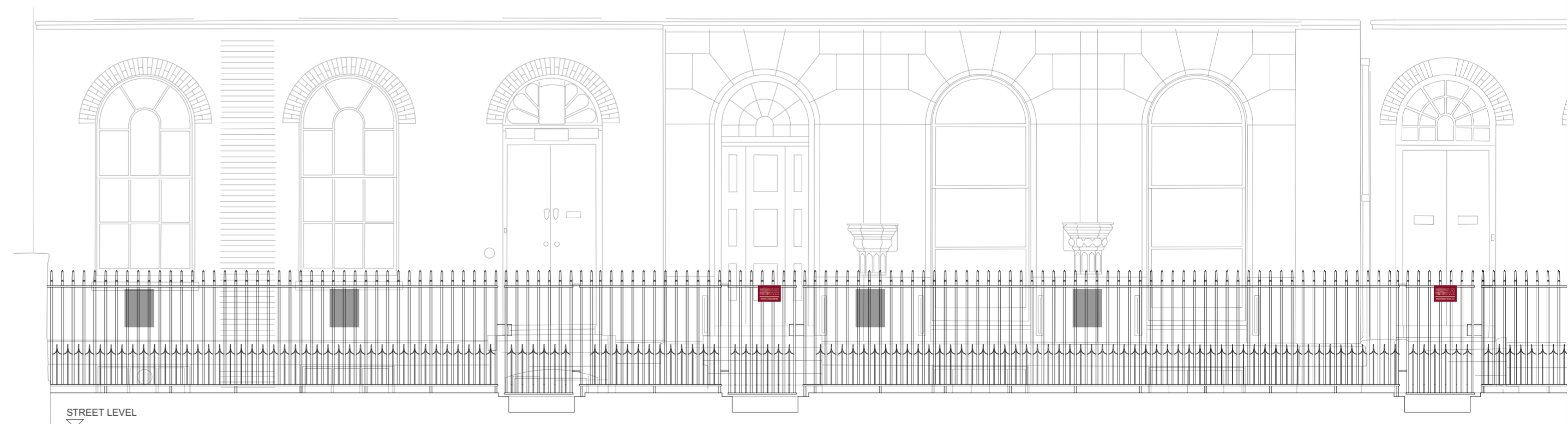
SIGN OVERVIEW – NOT TO SCALE

Panel treated to be suitable for all weather