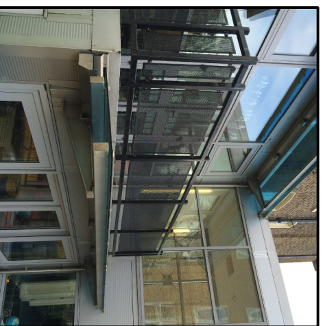
Existing balcony arrangement

new gutter connected to existing RWP vis new 75mm dia branch