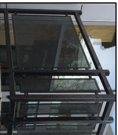
Existing balcony railings to be re-used.