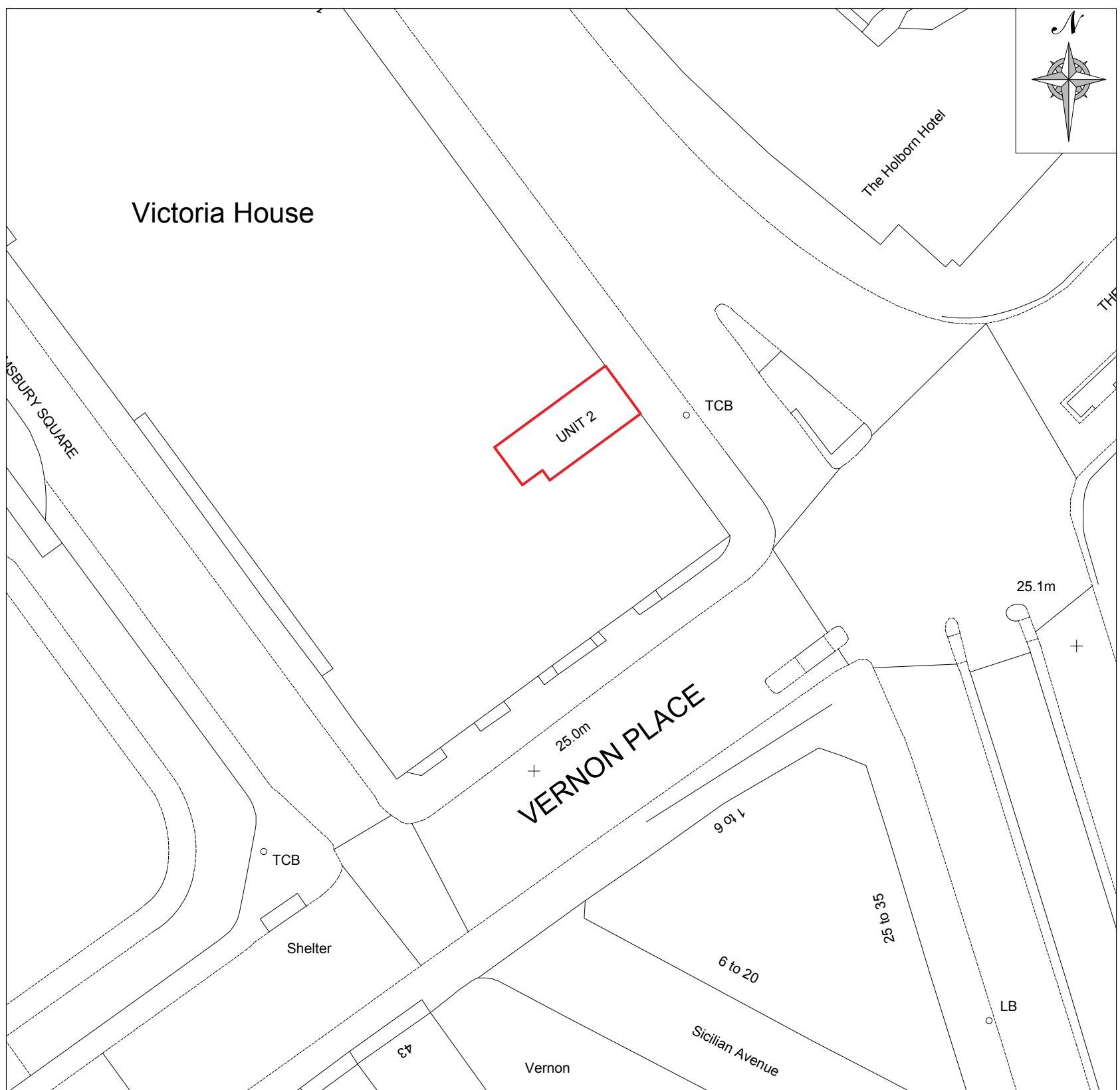
Block Plan - 1:500