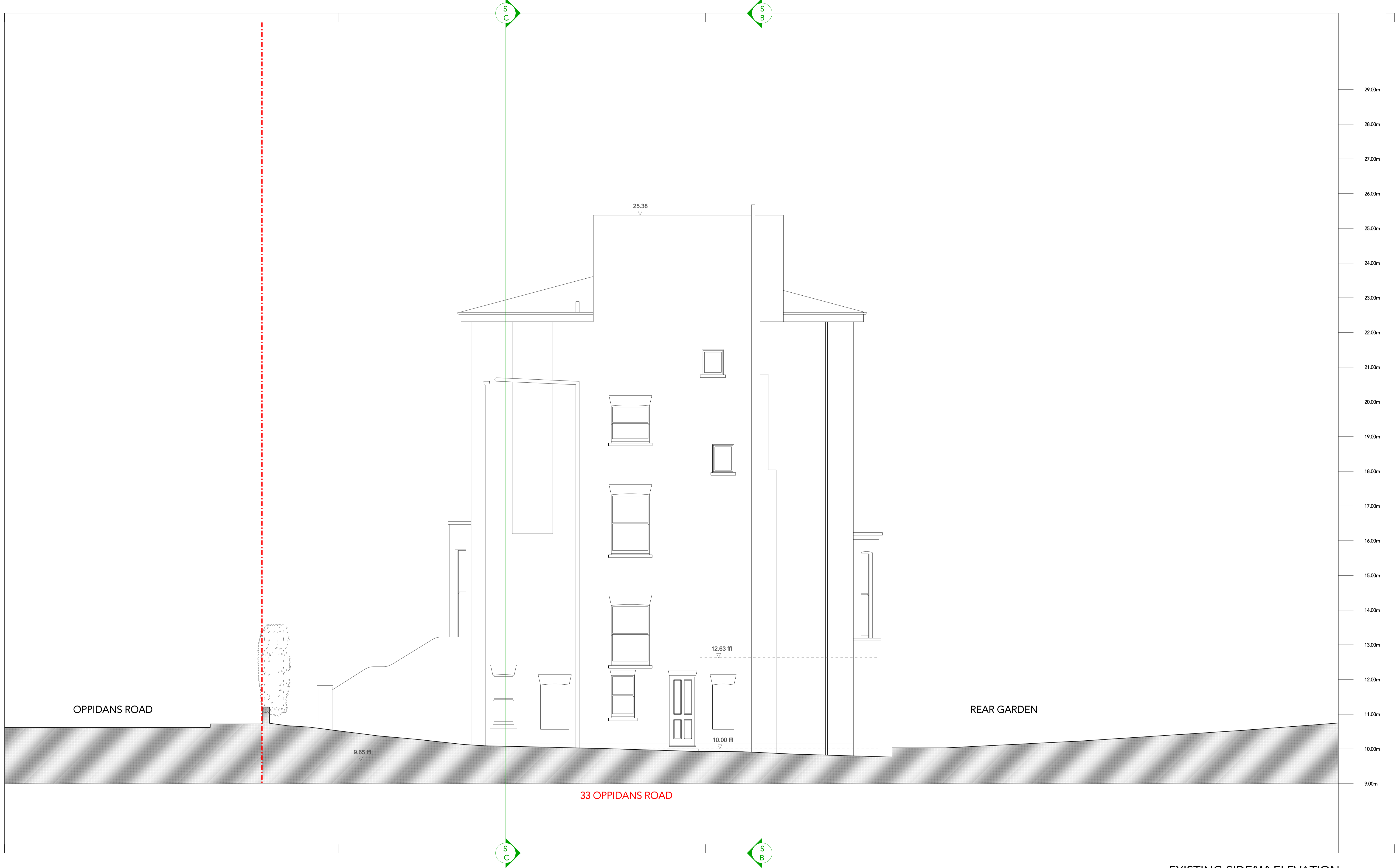
EXISTING SIDE(W) ELEVATION