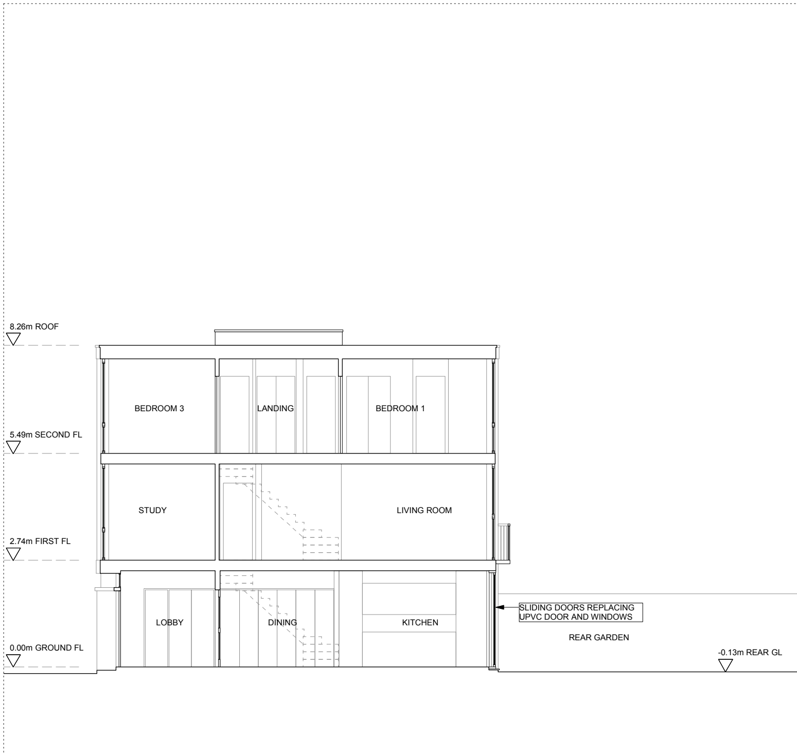
PROPOSED SECTION A @ SCALE 1:100