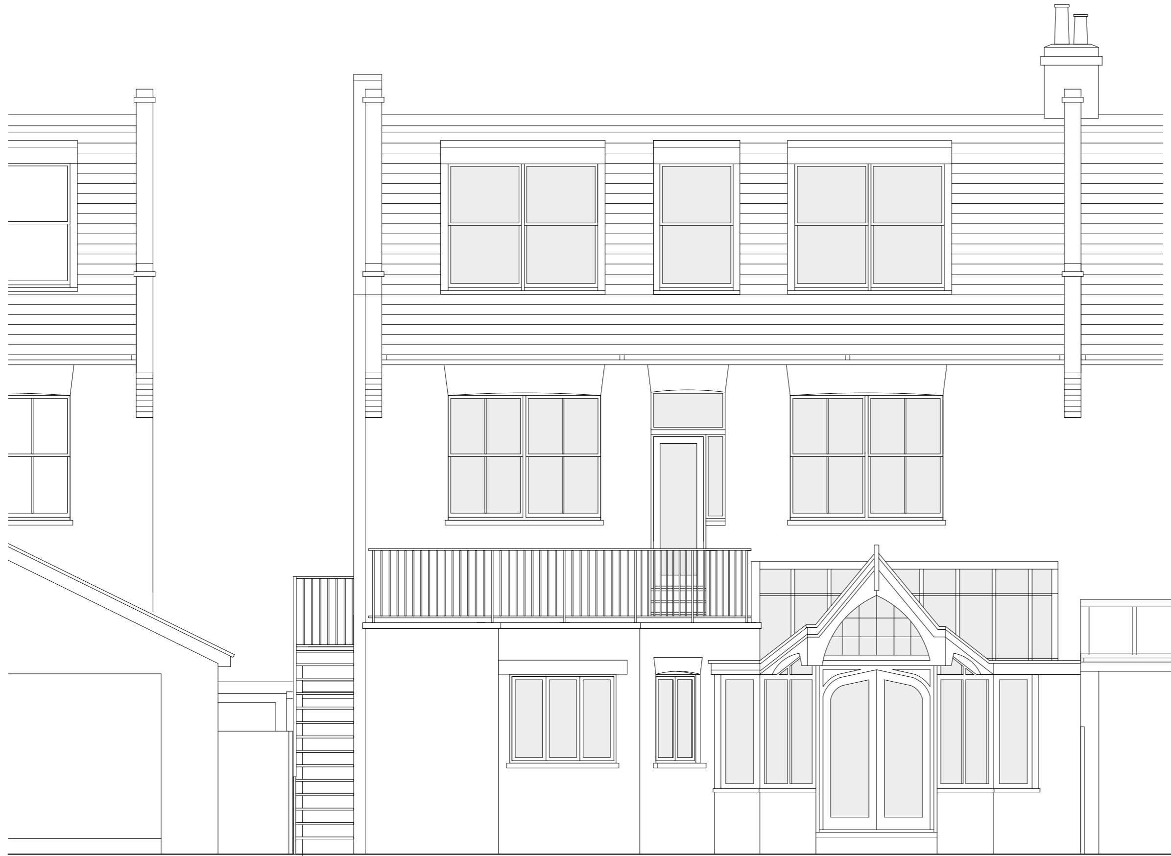
Existing Rear Elevation scale 1:50 @ A2