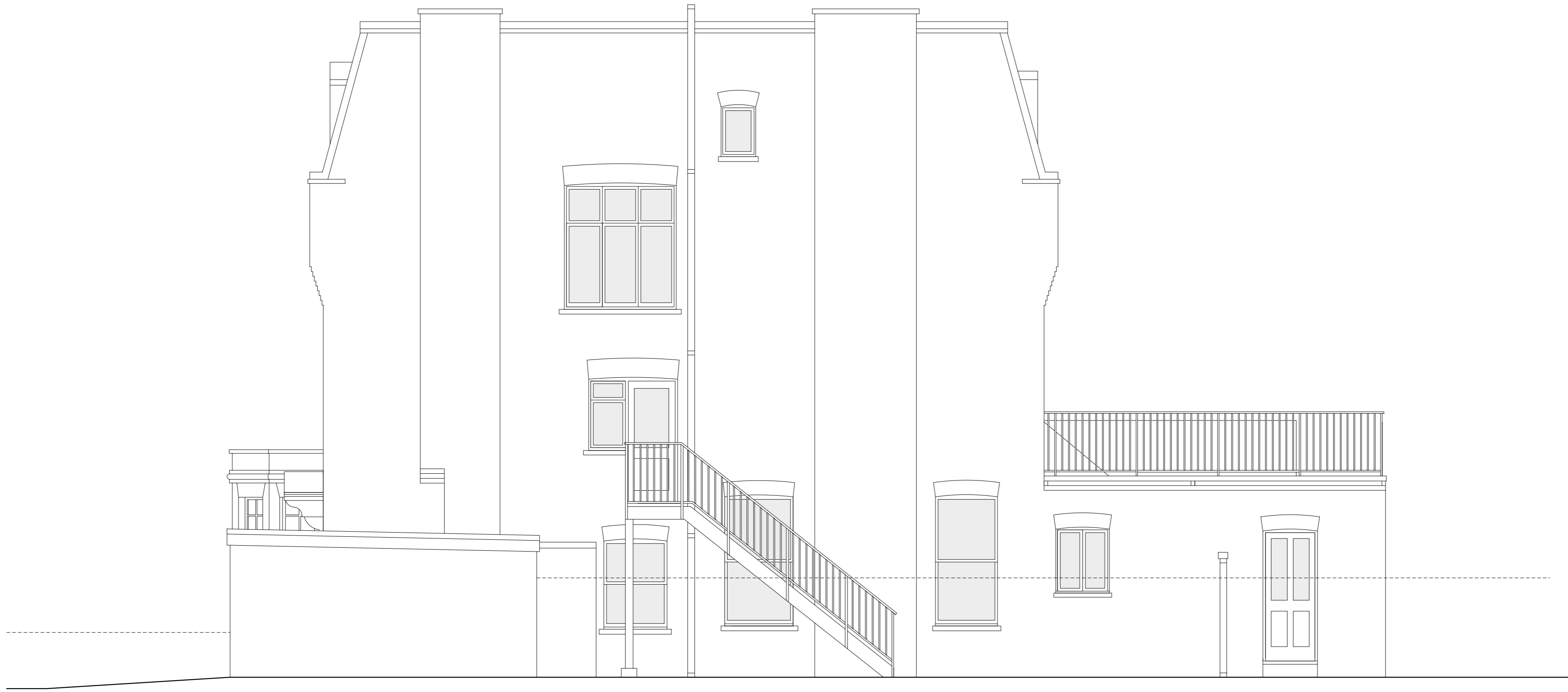
Existing Side Elevation scale 1:50 @ A2