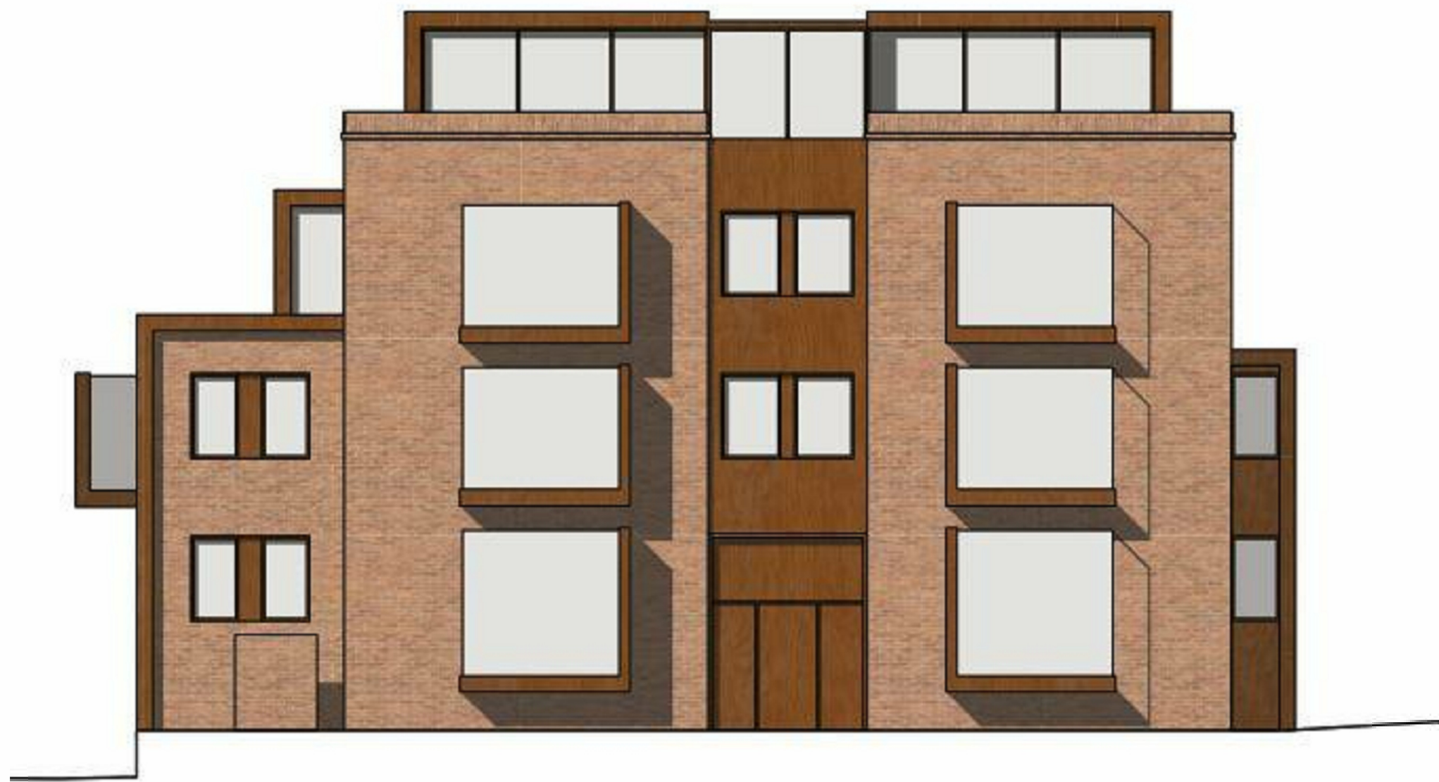
South Elevation - Proposed 1 : 100

0m 2m 4m 6m 8m 10m VISUAL SCALE 1:100 @ A1