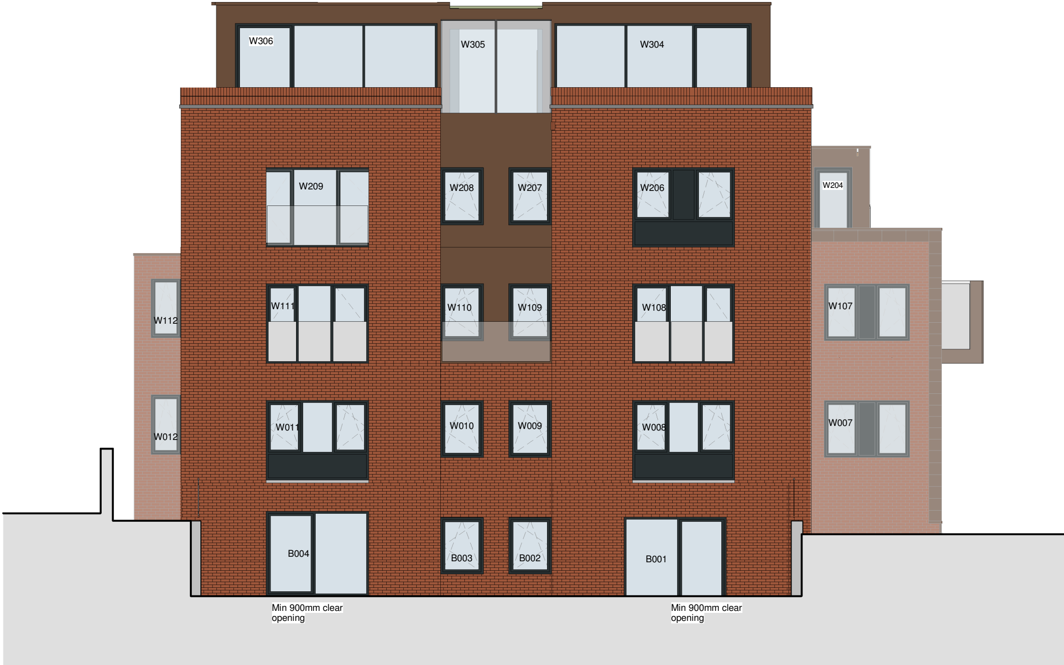
North Elevation - Proposed