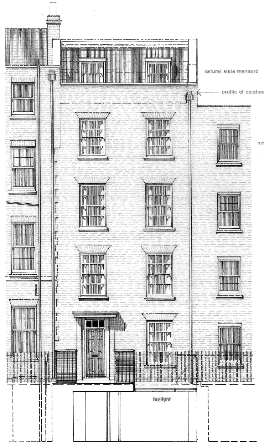
Proposed Street Elevation