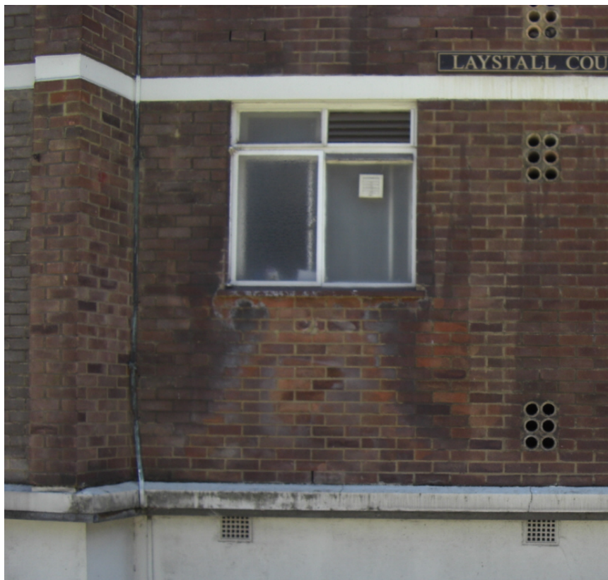
WINDOW TYPE C