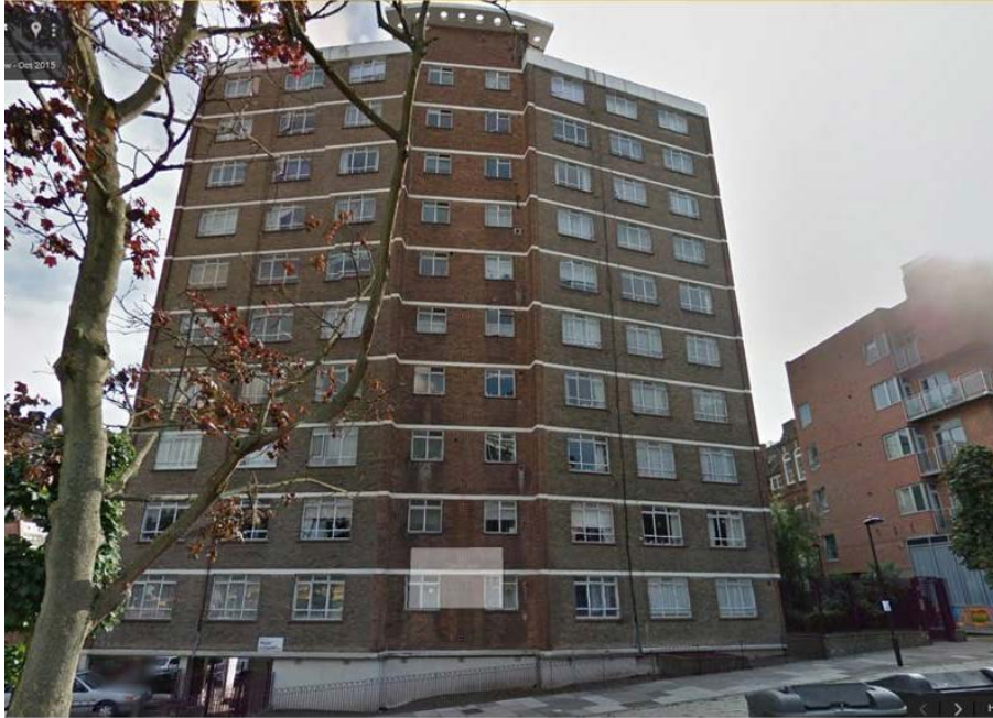
FRONT ELEVATION OF LAYSTALL COURT