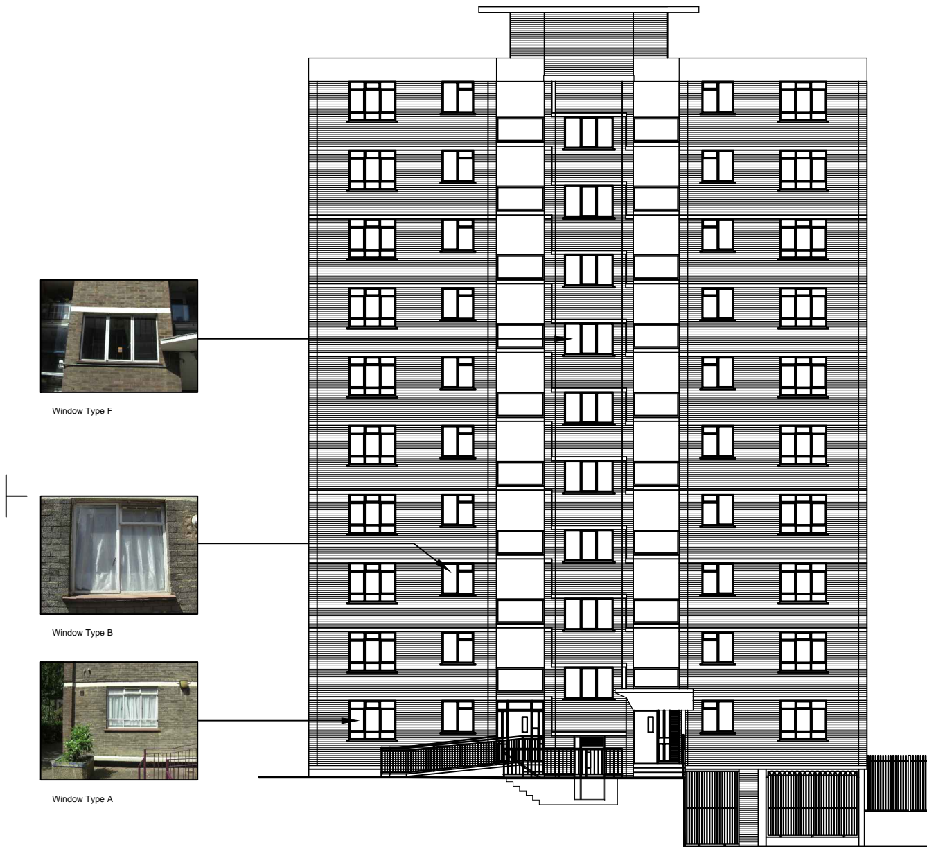
REAR ELEVATION (SOUTH EAST)