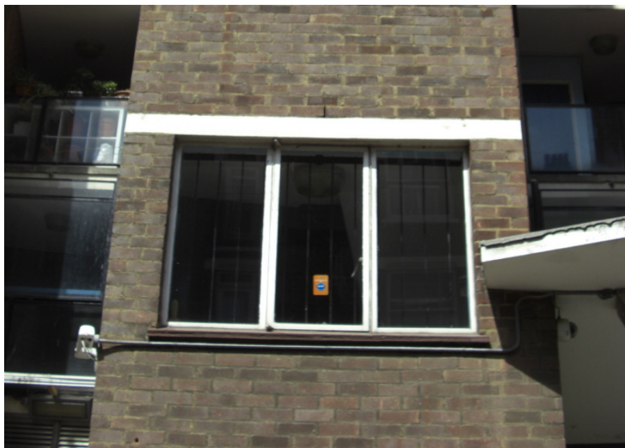
WINDOW TYPE F