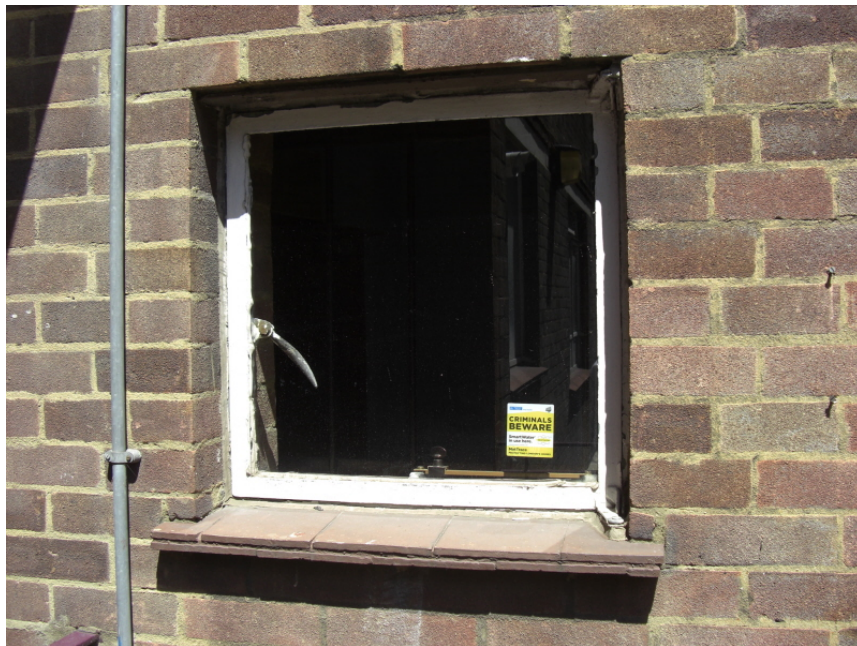
WINDOW TYPE E