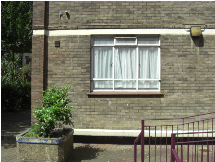
WINDOW TYPE A