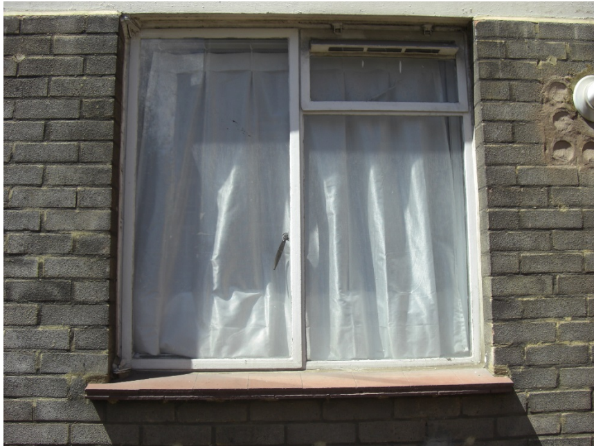
WINDOW TYPE B