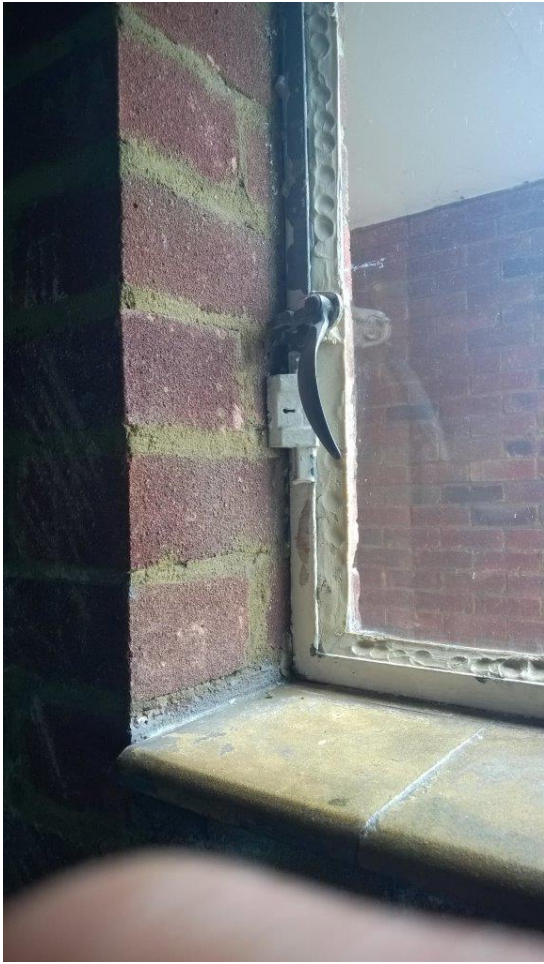
INTERNAL HANDLE AND DEFECTIVE PUTTY