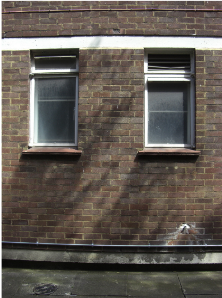
WINDOW TYPE D