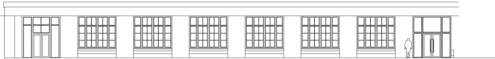
Existing D1 Entrance