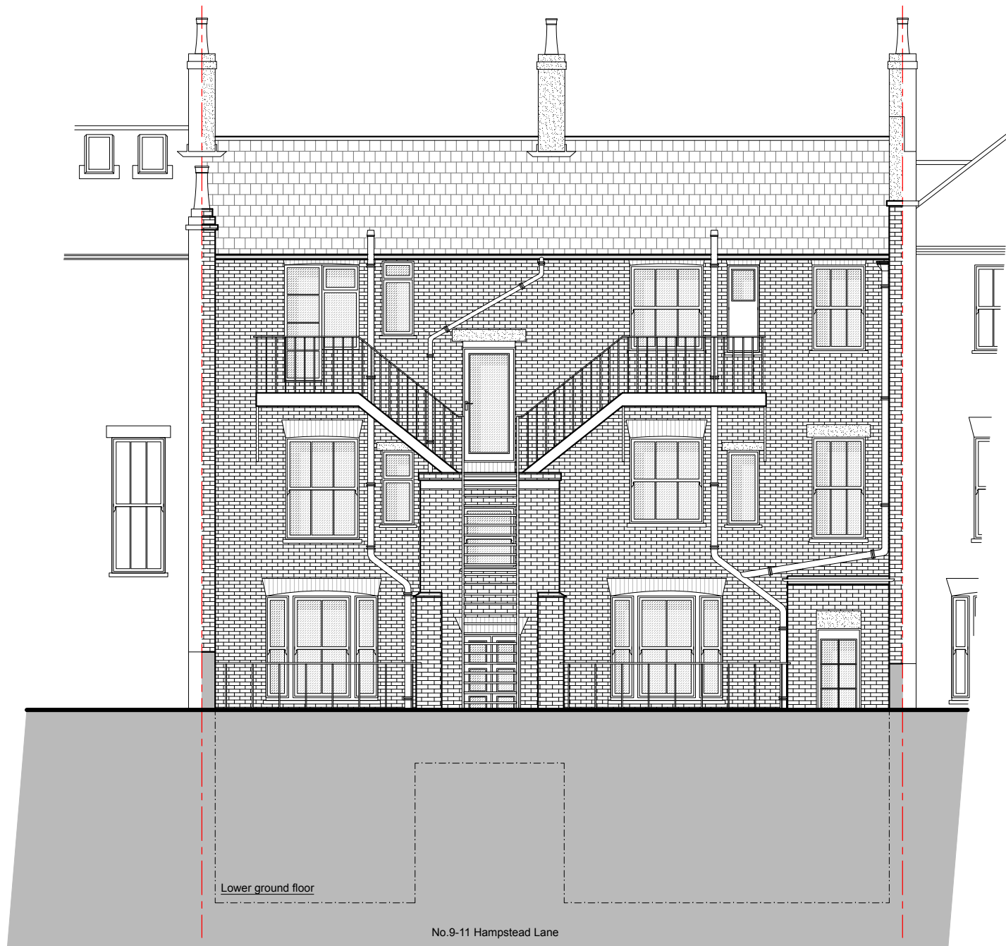
Rear Elevation As Existing - Scale 1:100