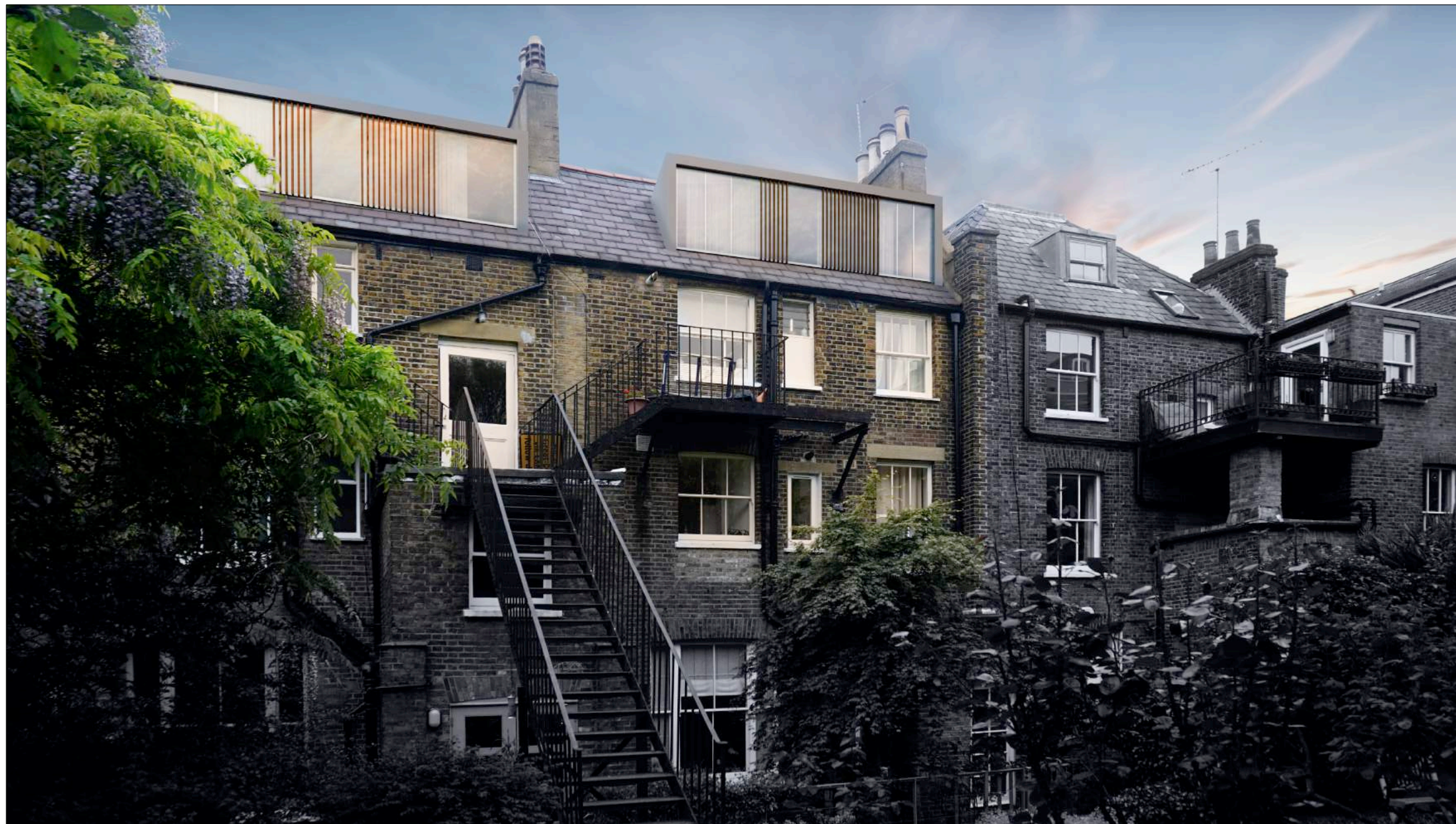
Visualisation of Proposed Development (II)

property owner to ensure that all aspects of the "party wall etc., act 1996" are complied with prior to any works commencing on site.