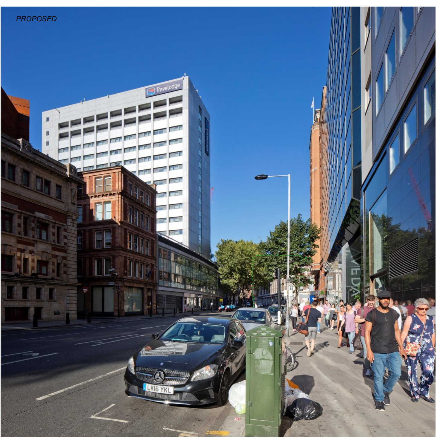
The remodelling and refurbishment of 182 High Holborn has been informed by the built hierarchy and materiality of the local context to provide a legible street scene to the corner of High Holborn and Smarts Place which is lacking in the existing building