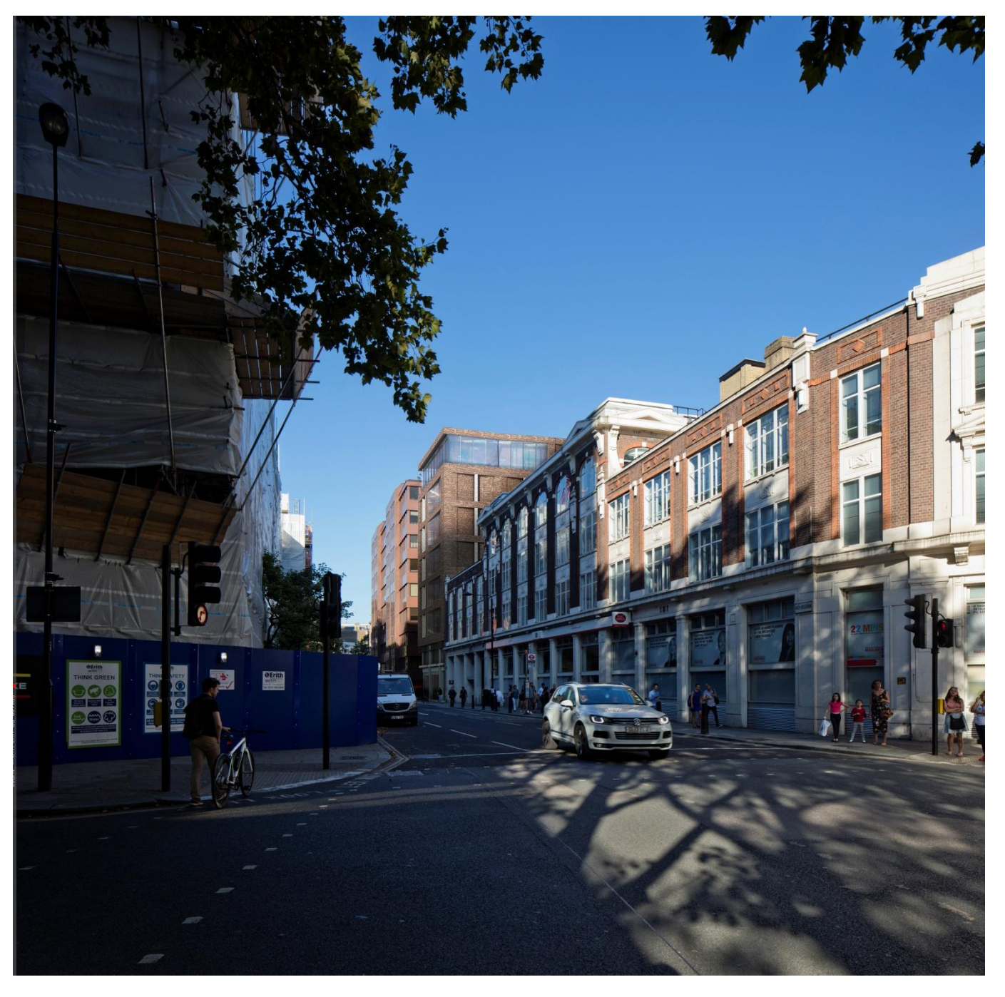
The principal elevation fronting High Holborn returns to form the boundary condition of the neighbouring post office building which has been meticulously designed to create a worthy backdrop to the non designated heritage asset.