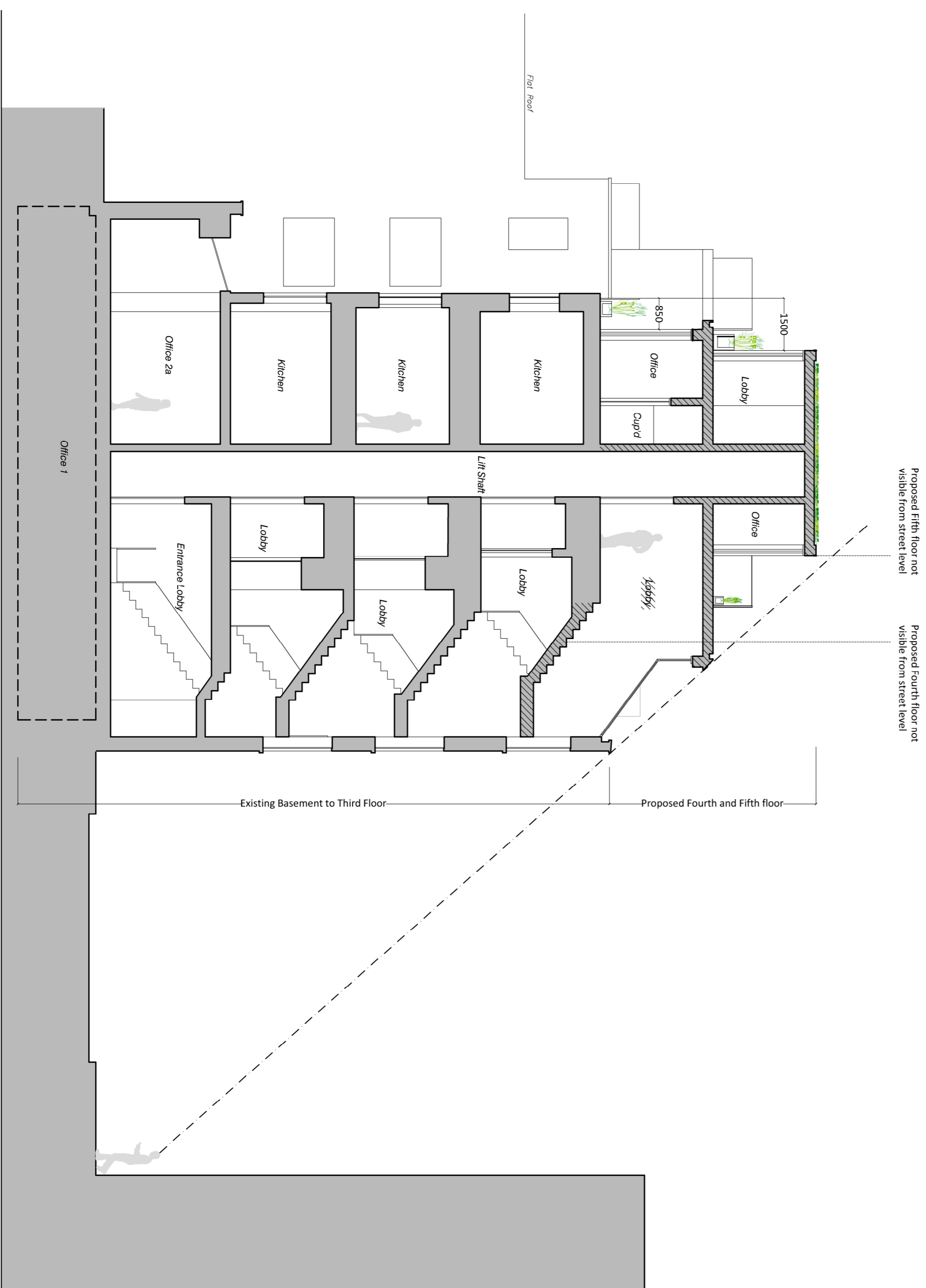
PROPOSED SECTION A-A