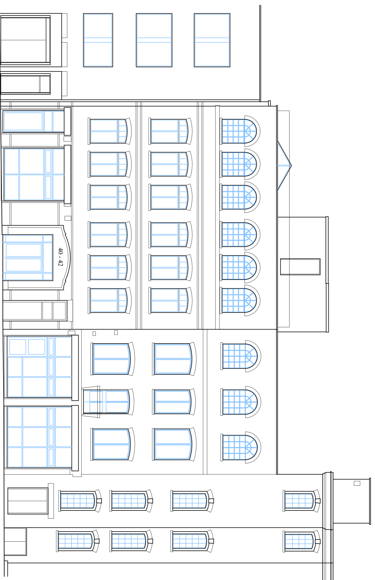
Datum: 20.00m. Elevation 1 (Front elevation)