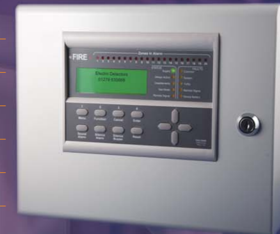
20 Zone Panel pictured. 8 and 100 Zones Available.