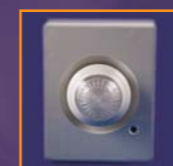
EDA-A6030 Sounder/LED Strobe