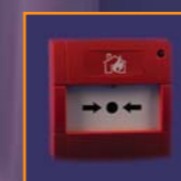
EDA-C5000 Manual Call Point