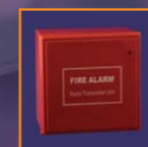
EDA-T6000 Radio I/O Unit

See Associated data-sheets for full equipment specification www.electrodetectors.co.uk/data-sheets Only a small selection of devices are shown. For the complete range and for a full specification please visit our website.