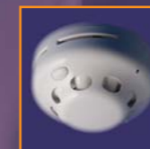
EDA-R6000 Smoke Detector/Sounder