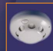
EDA-R5000 Smoke Detector