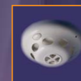
EDA-D5000 Heat Detector