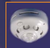
EDA-R6030 Smoke Detector/Sounder and Beacon