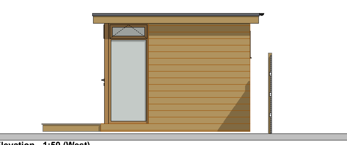
Side Elevation - 1:50 (West)