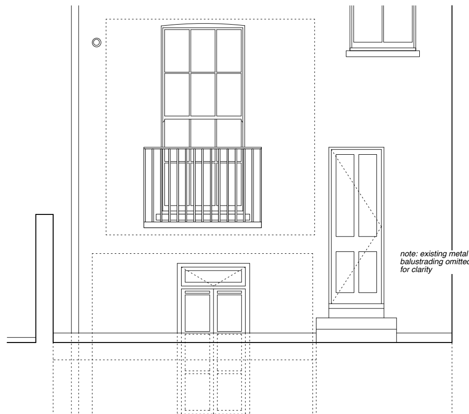
REAR ELEVATION (RAILINGS/BALUSTRADING OMITTED FOR CLARITY)