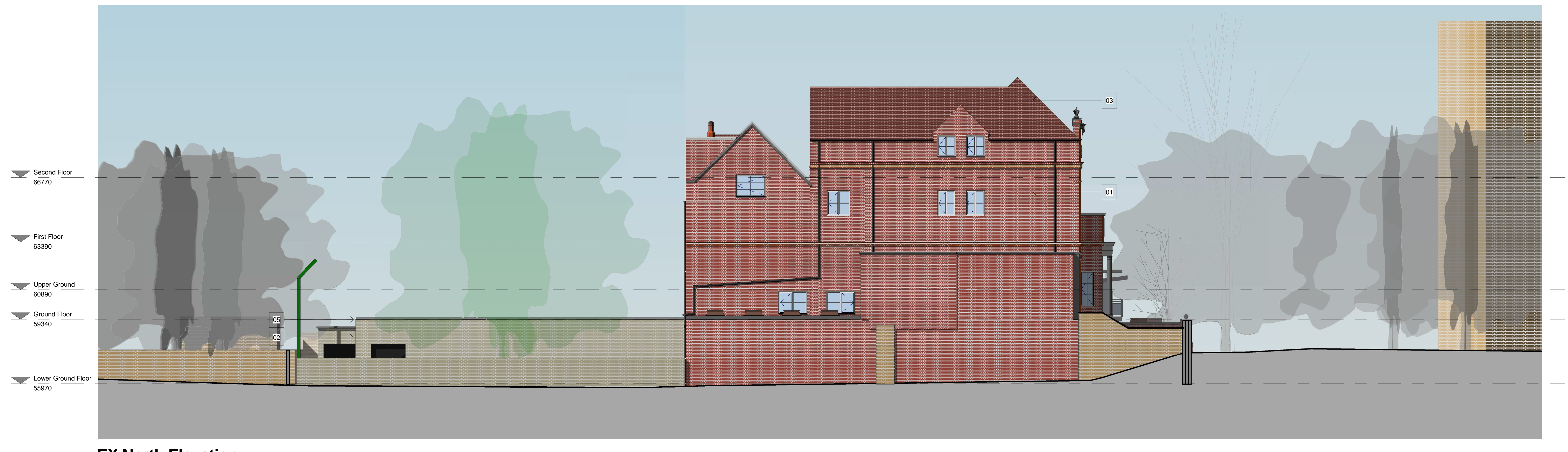
EX North Elevation