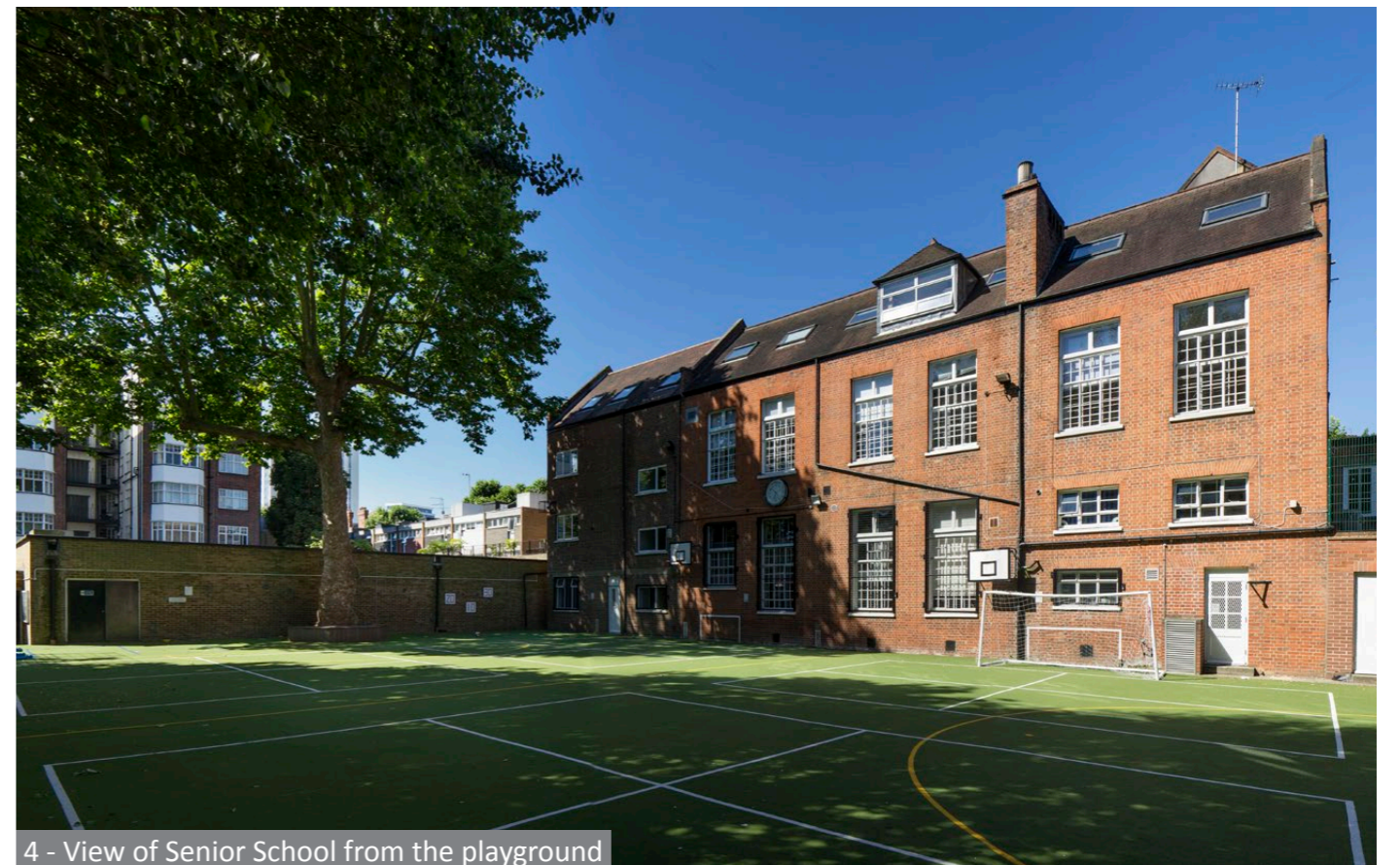
4 - View of Senior School from the playground