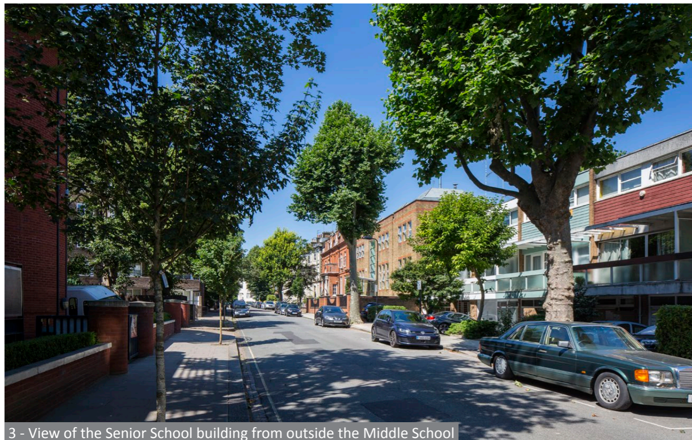
3 - View of the Senior School building from outside the Middle School