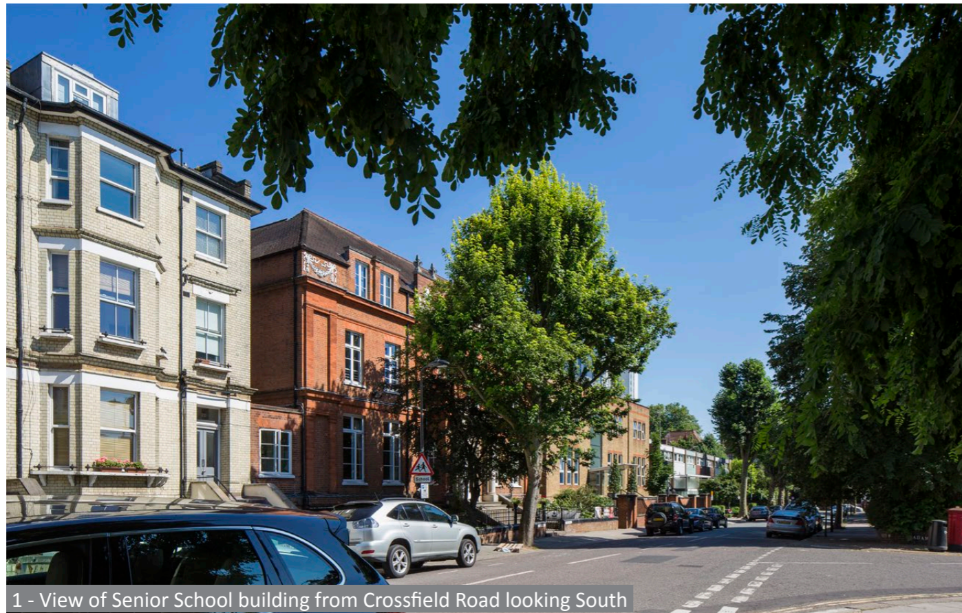
1 - View of Senior School building from Crossfield Road looking South