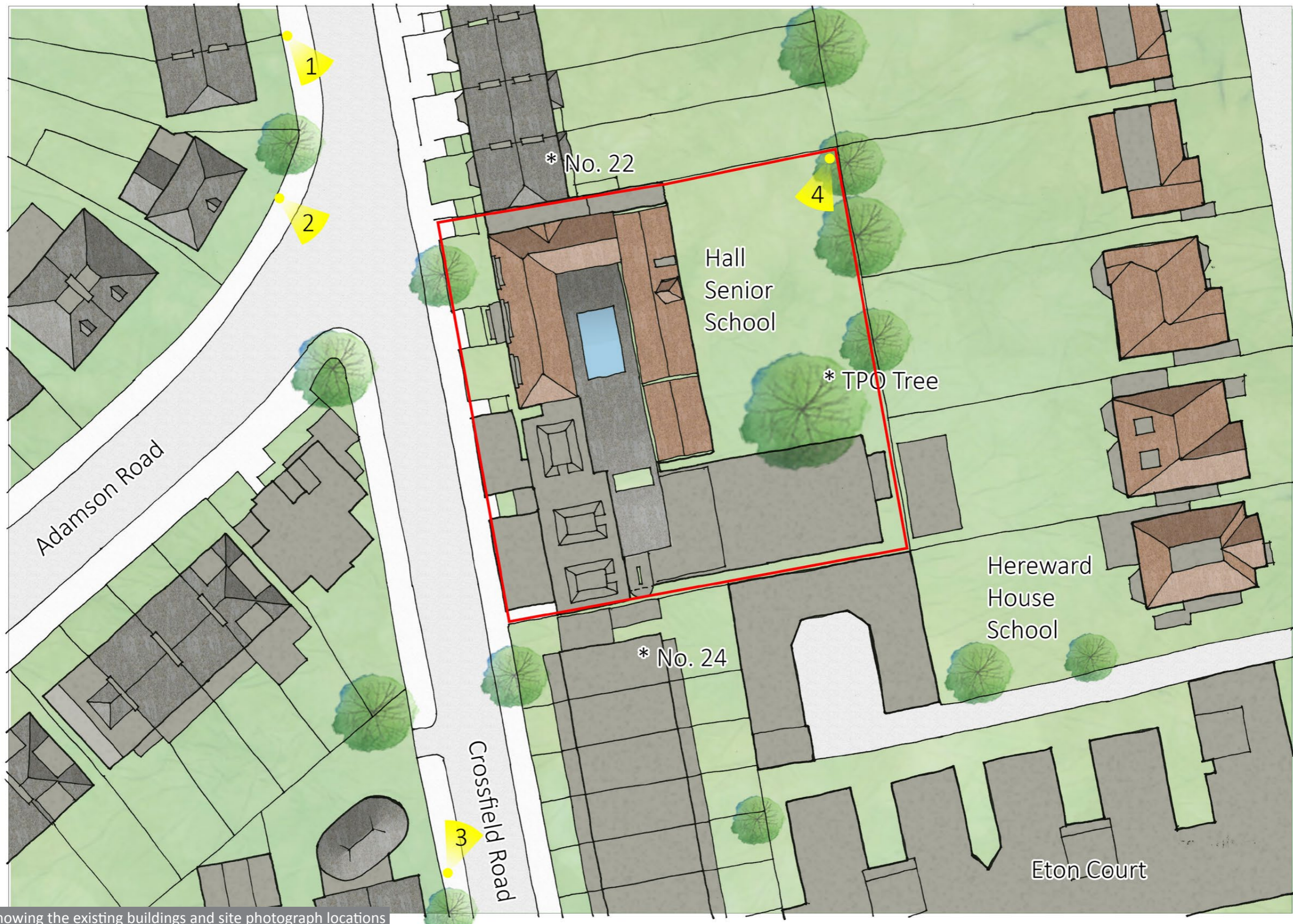
Site plan showing the existing buildings and site photograph locations