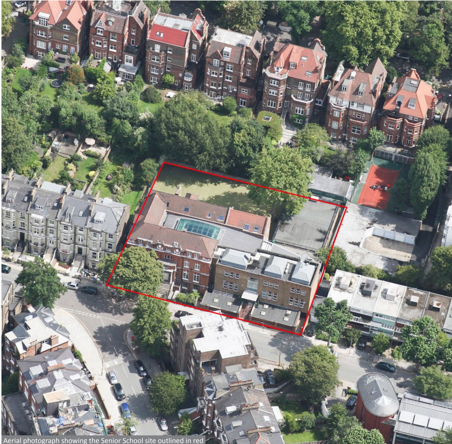
Aerial photograph showing the Senior School site outlined in red