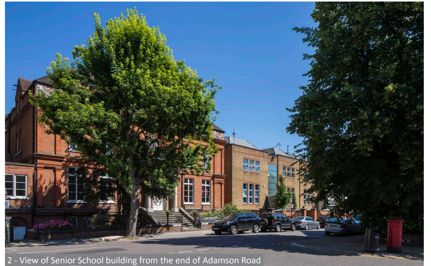
2 - View of Senior School building from the end of Adamson Road