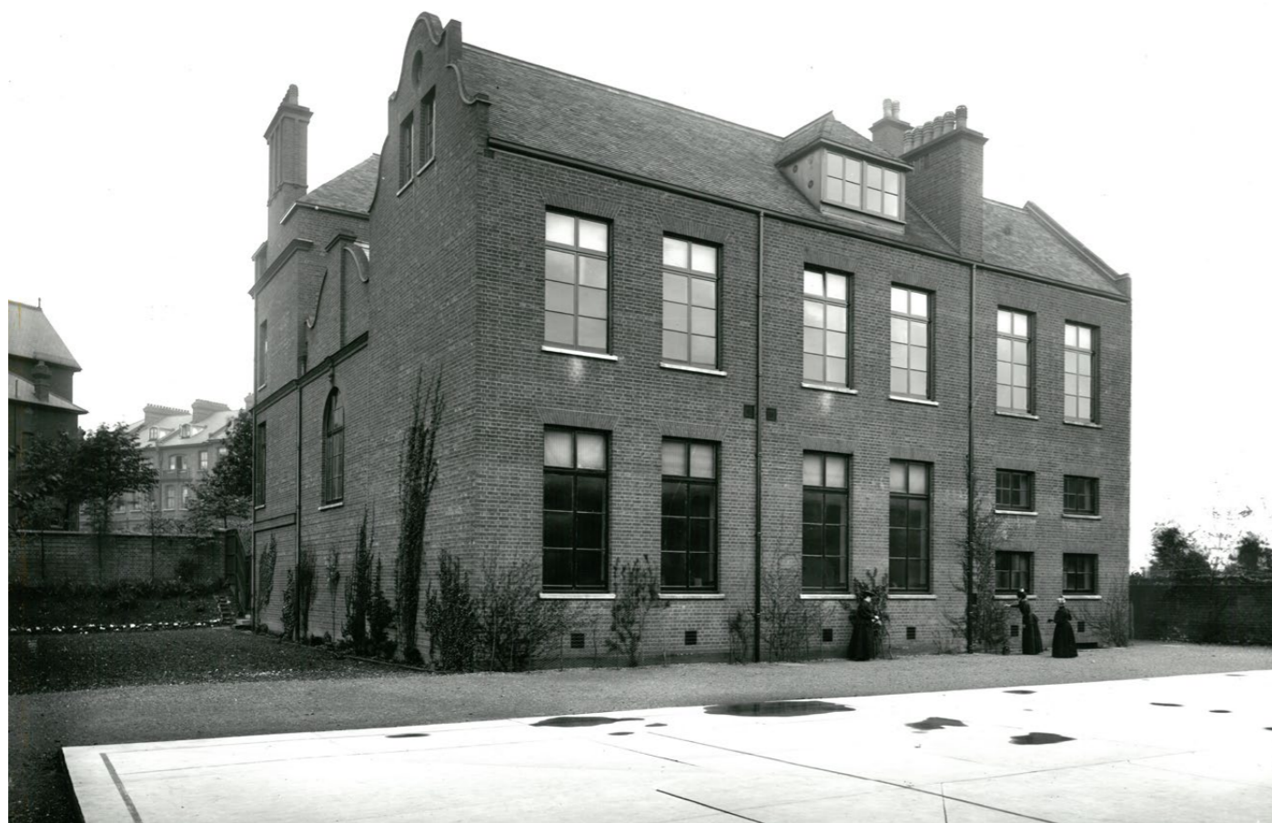
Historical photograph of the original school building from the playground, dated 1894

Recognising the importance of heritage and conservation matters, the Hall School has engaged the services of Montagu Evans to advise on the design of the proposals. Montagu Evans have prepared a Heritage Appraisal which accompanies this application.