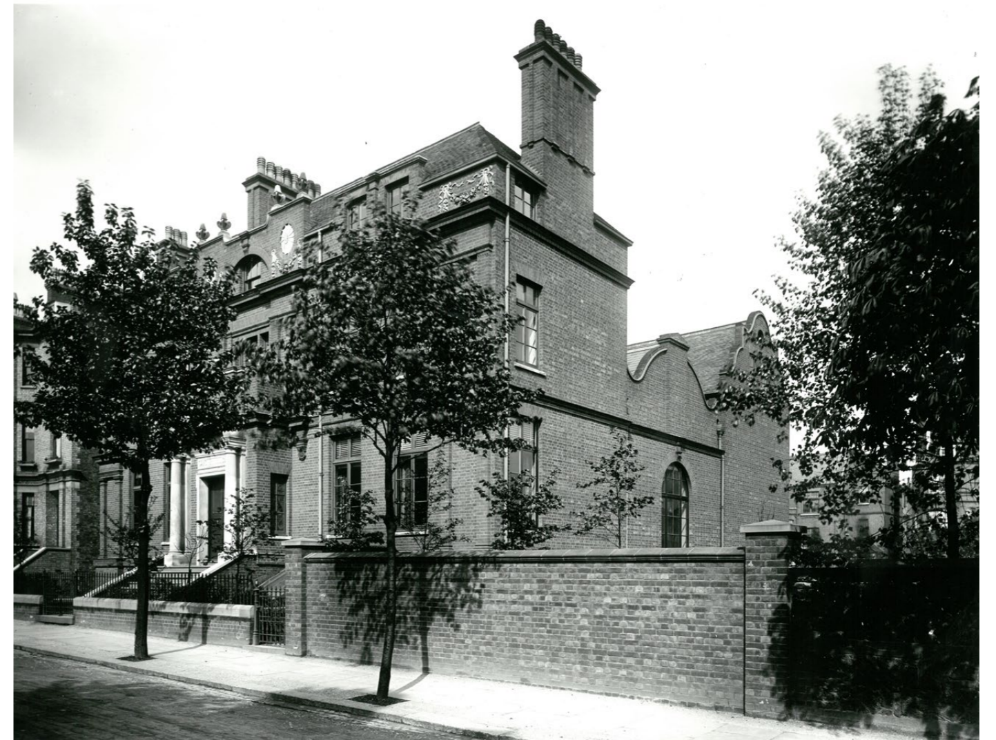
Historical photograph of the original school building from Crossfield Road, dated 1894