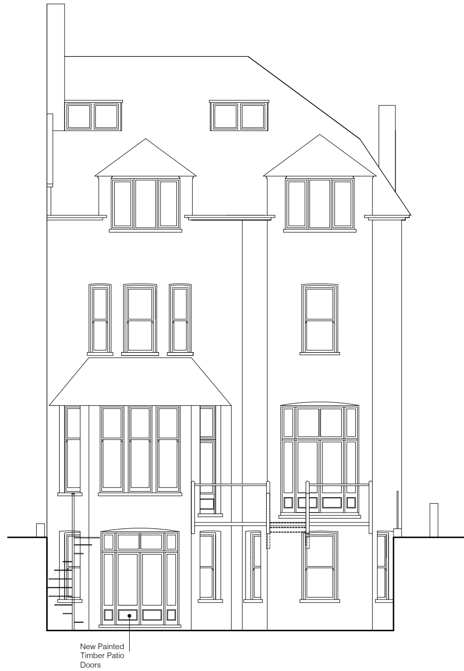
01 PROPOSED EAST ELEVATION. 1:100 @ A3 PL406