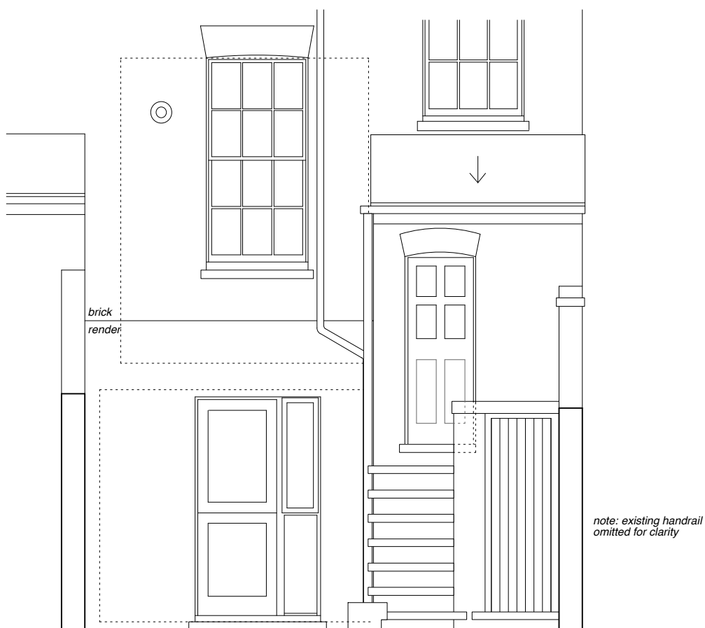
REAR ELEVATION (RAILINGS/BALUSTRATING OMITTED FOR CLARITY)