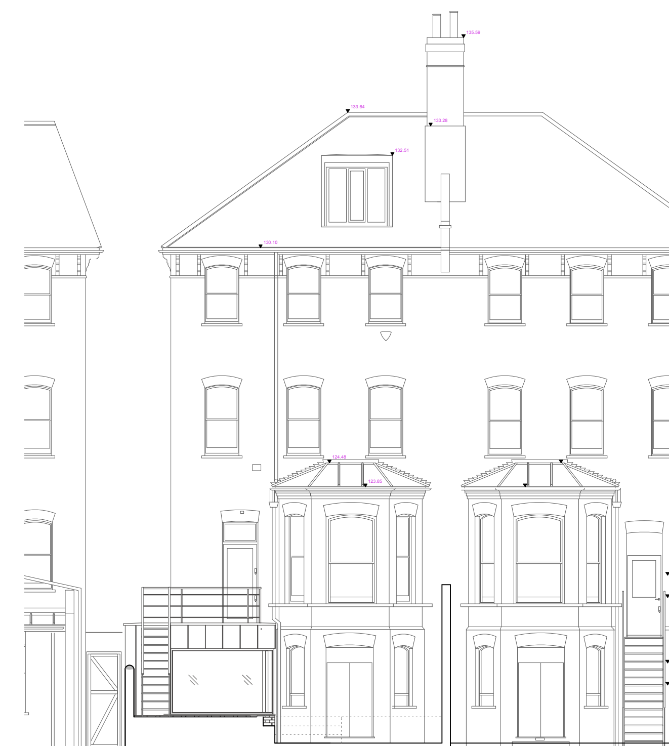
05 Proposed North Elevation / 21A Cannon Place Scale 1:100

Notes A 29/4/16 Revision for Planning B 4/11/16 Revised window on East Elevation C 14/11/16 Revised depth of extension on West Elevation