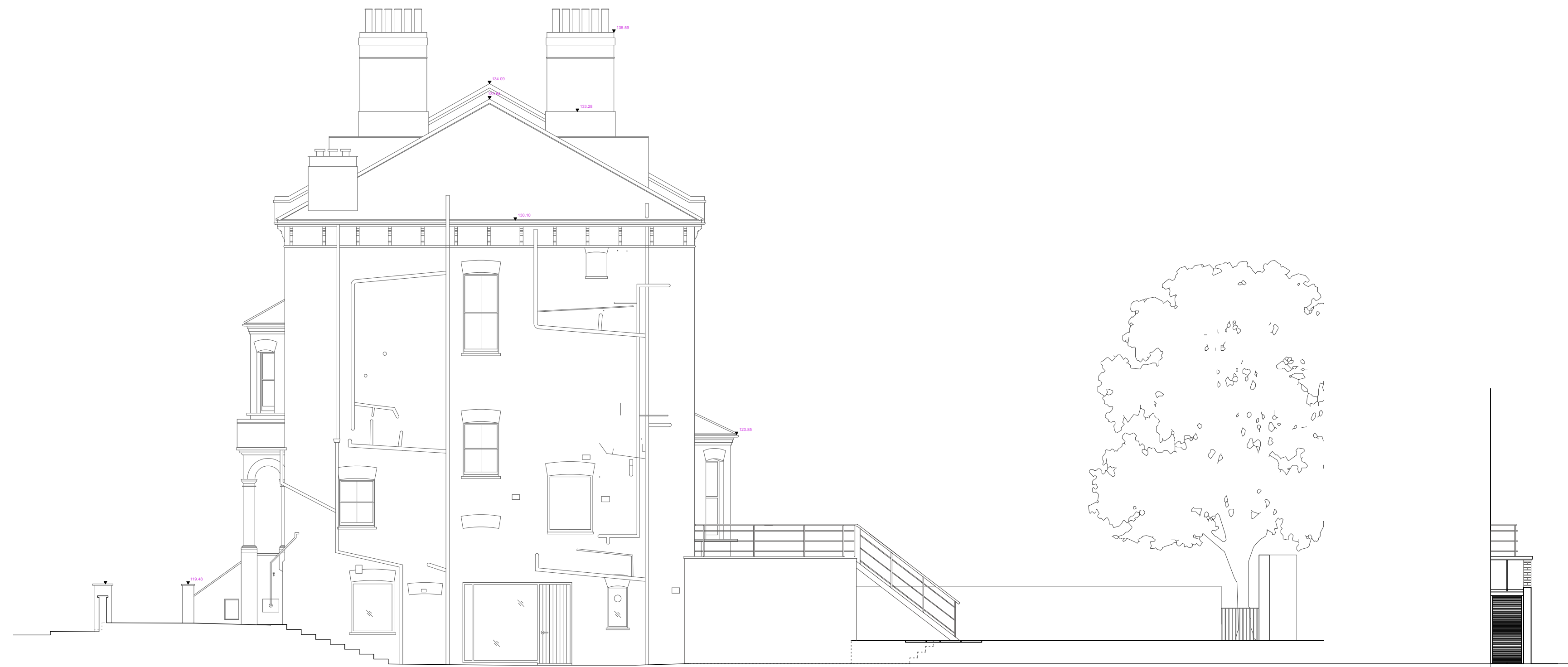
03 Proposed East Elevation / 21A Cannon Place Scale 1:100