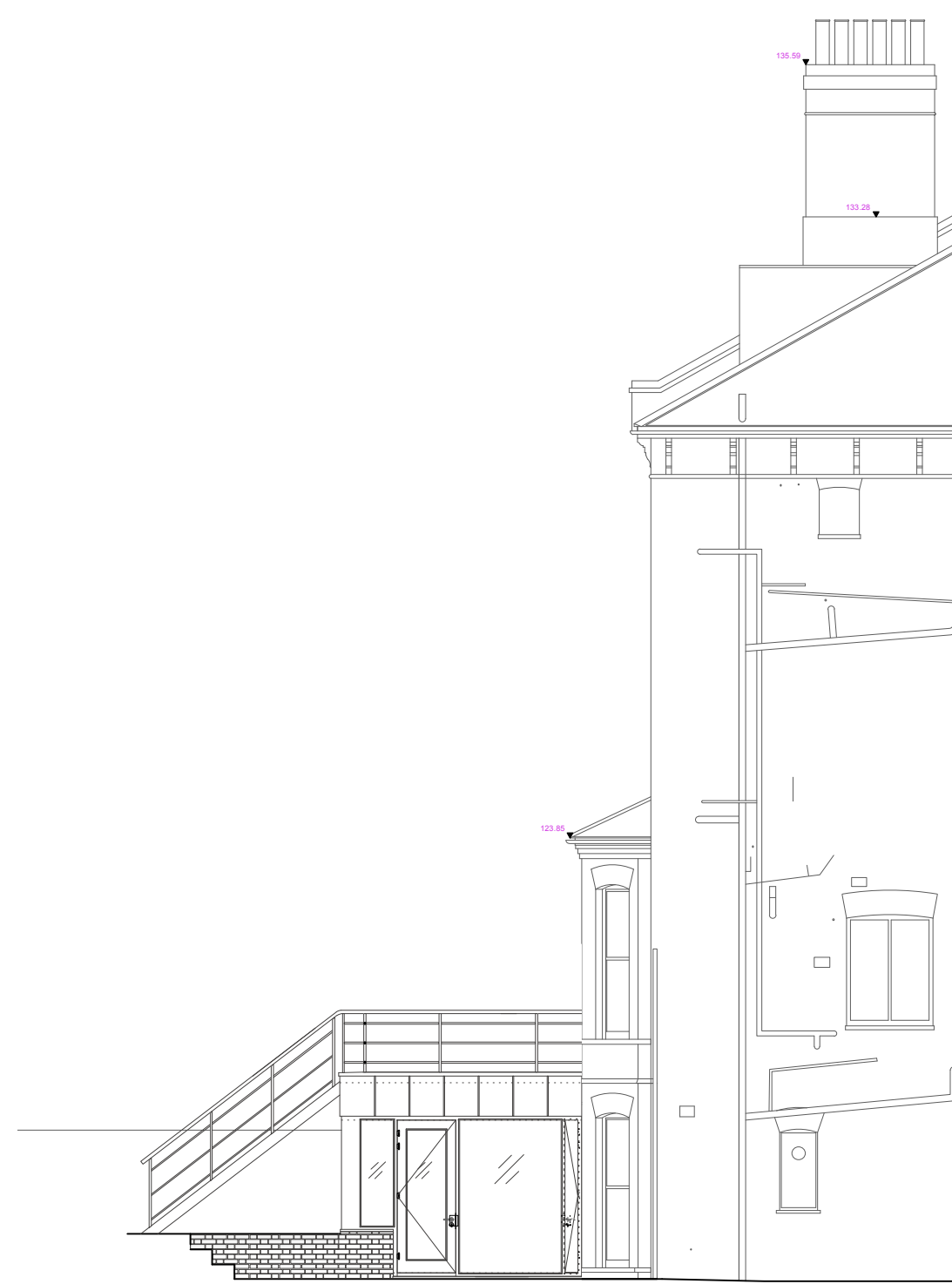
04 Proposed West Elevation / 21A Cannon Place Scale 1:100