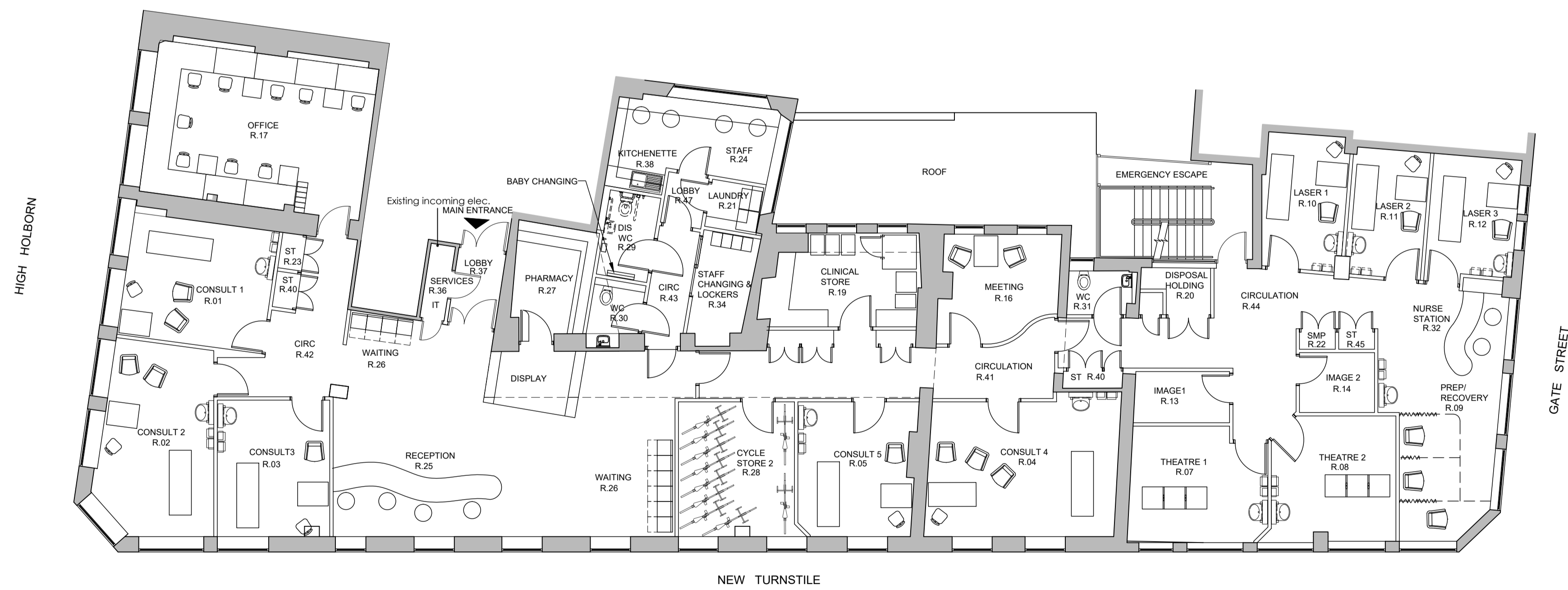
FIRST FLOOR PLAN AS PROPOSED