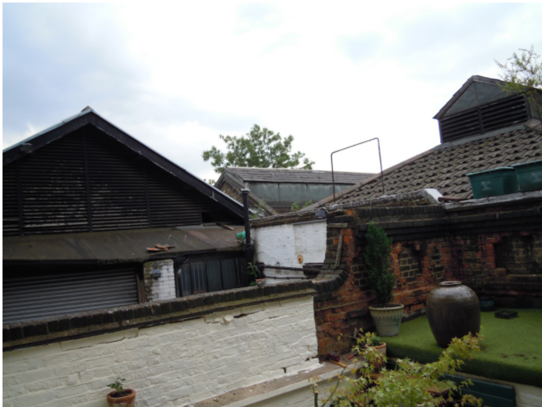
View of roofs from adjoining flat