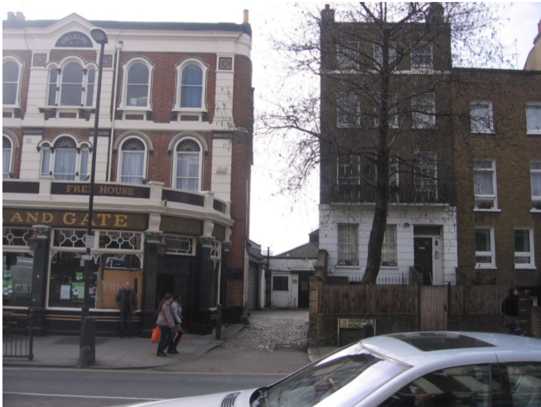
Front entrance from alley