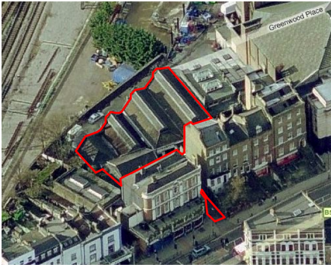
Aerial photo of site and access