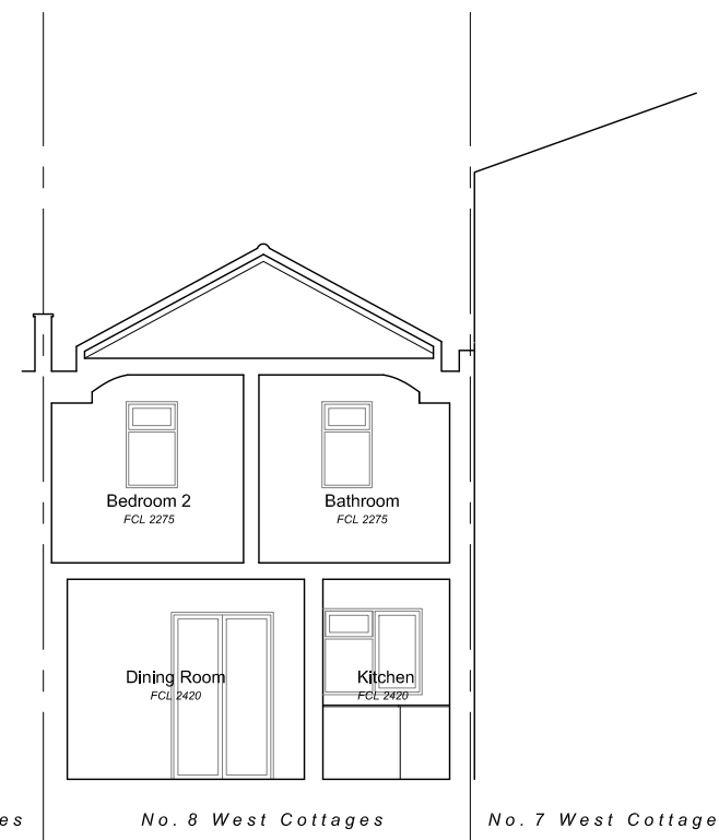
Existing Section C