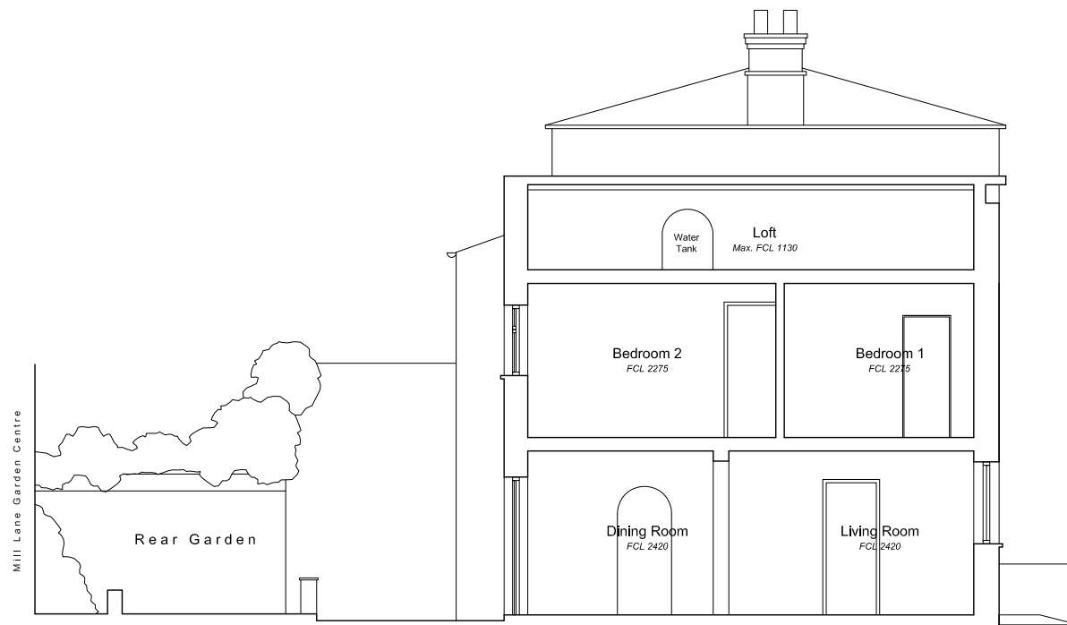
Existing Section A

Copyright remains with the architect. This drawing is to be read in conjunction with the notes specification and all other relevant information. No disclosure or copies may be made without prior written permission.