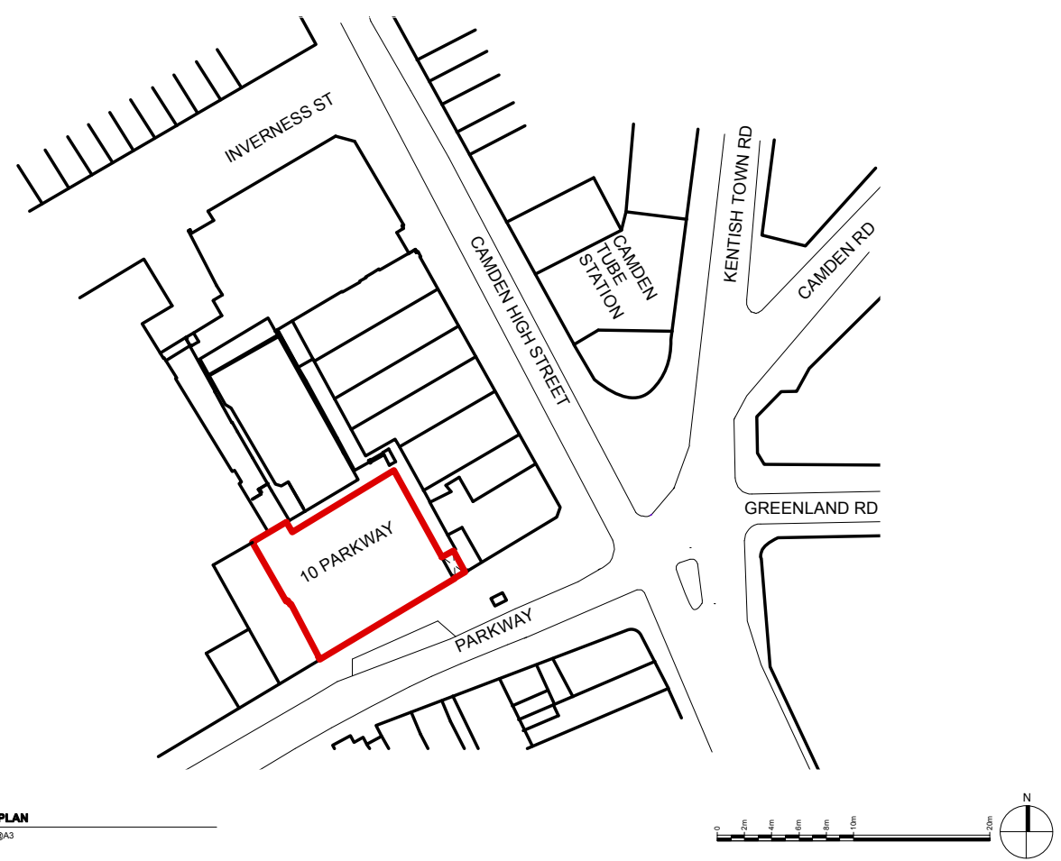
SITE PLAN 1:1250@A3

Setting out and all G.A. drawings prepared from survey information provided by others. All setting out must be checked on site. All levels must be checked on site and refer to Ordnance Datum Newlyn unless alternative Datum given. All fixings and weatherings must be checked on site. All dimensions must be checked on site. This drawing must not be scaled. This drawing must be read in conjunction with the relevant specification clauses. This drawing must not be used for land transfer purposes. This drawing must not be used on site unless issued for construction.