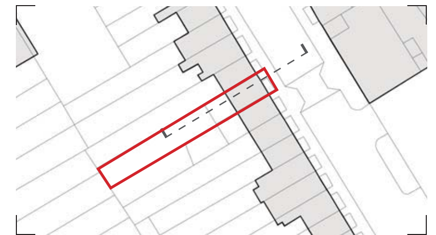
SECTION A. DRAWING no. 2200/B. 1:50@A3

None of the existing fabric, including floor boards, door joinery, plasterwork, skirtings, cornices, dado caps, picture rails and ironmongery, are to be altered or removed unless otherwise shown on the drawings.