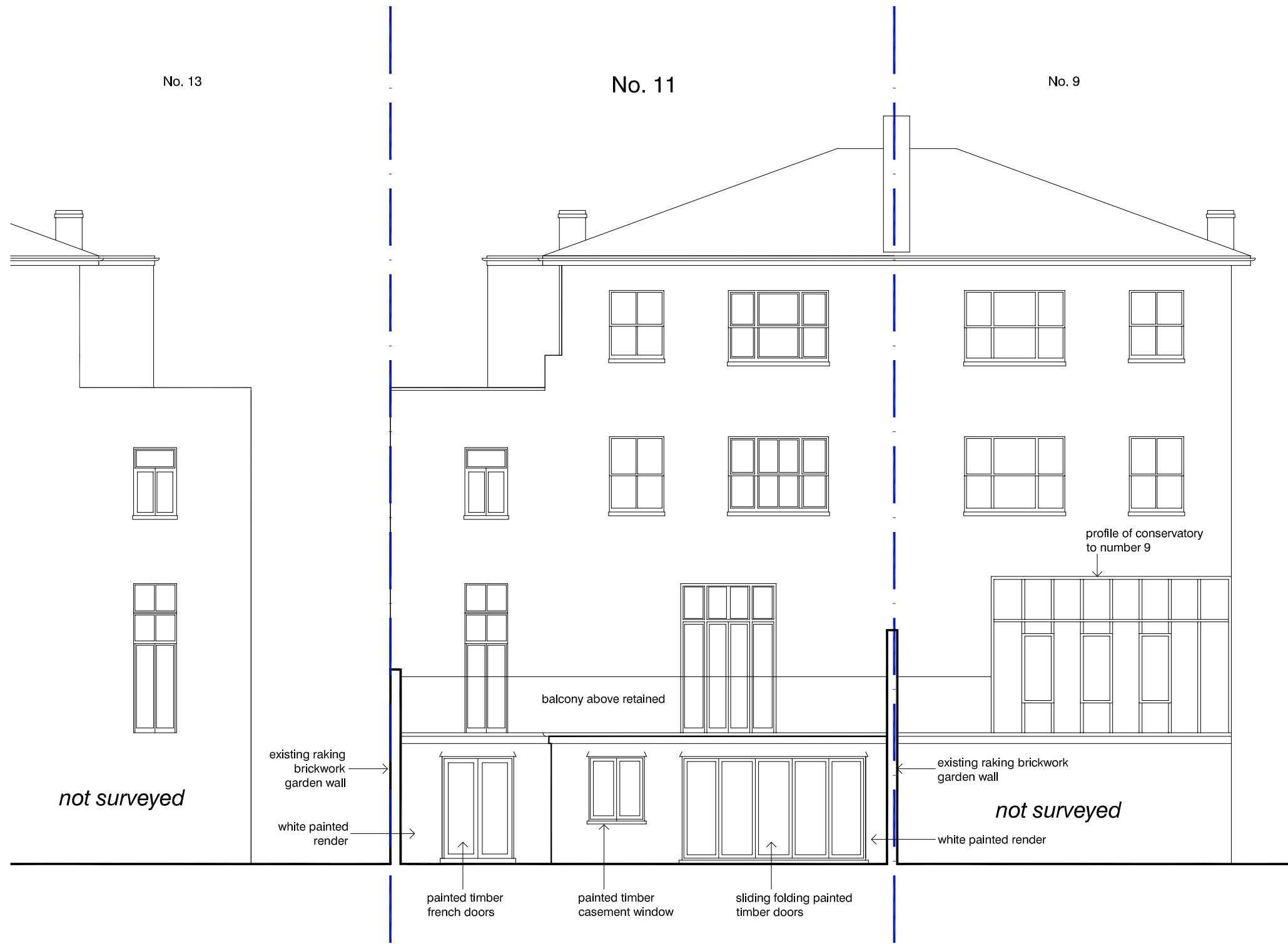
rear elevation as proposed