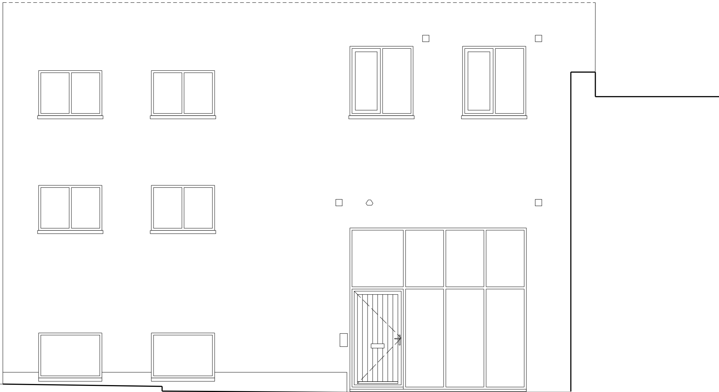
ELEVATION AT ENTRANCE, GROUND FLOOR.